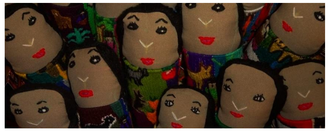
640 CRAFTSWOMEN IN 22 INDIGENOUS COMMUNITIES