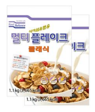
Multi flake classic(big pouch)