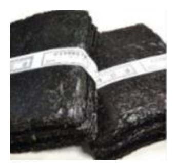
Dried laver stack