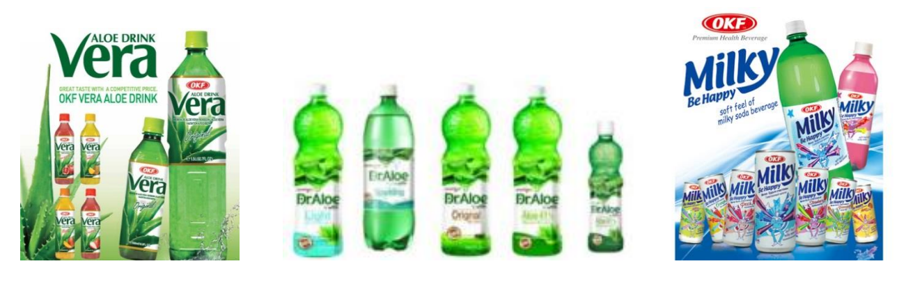
Aloe vera drink 30%, 20%