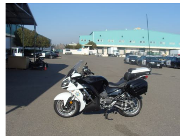
Custom Antenna & Match Box Design for Kawasaki Police Motorcycles.