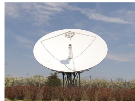
12 Meter Ku Band Antenna Design, Fabrication and Installation