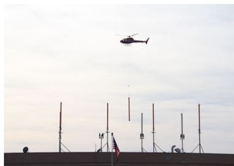
AS-1085/URC Design, Fabrication and Installation