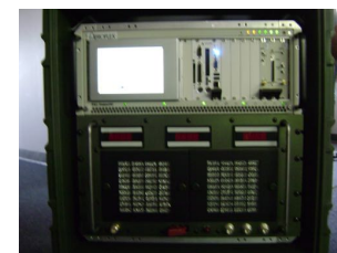
RFJ-11 Intelligent Radio Frequency Jammer