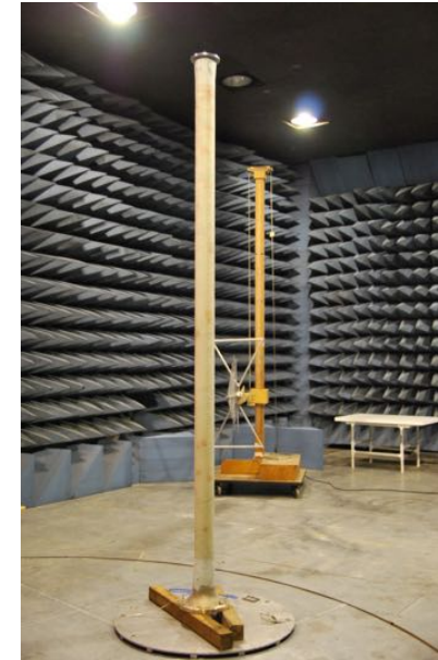
AS-1096/URC Antenna - Anechoic Chamber Testing for E / H Plane Patterns, Return Loss, VSWR