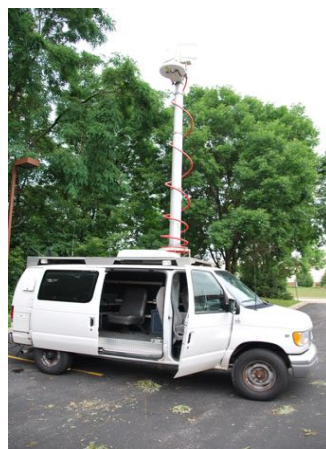
Mobile RF Surveillance Van