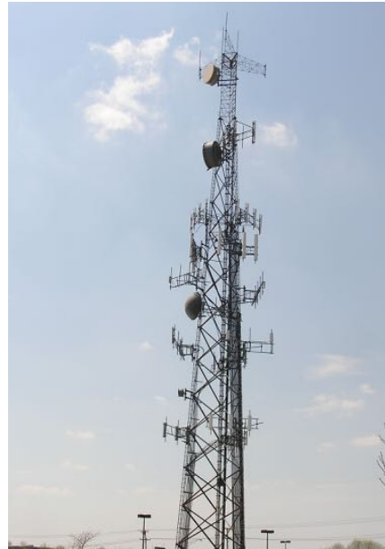
250 Foot Self Supporting Communication Tower: Design, Fabrication and Installation