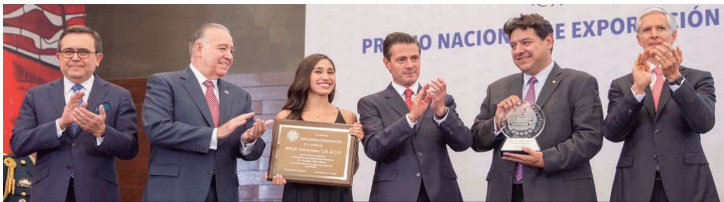
[Photo] National Export Prize Delivery 2018, by the President of Mexico Enrique Peña Nieto (Period in Mexico's Presidency from December 1st, 2012 to November 30, 2018)

It is important to address that some companies have been also recognized nationwide for their excellence in the control of their operations. This was the case of one of our most important customers, which in 2012, that faced one of their main challenges with the growth of the production lines in Ciudad Juarez Plant in Mexico and due to making strategic decisions, it allowed them to expand the development of its products nationwide.