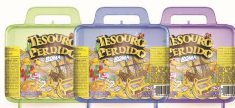
CÓD. 108 – Lost Treasure suitcase 190g Box 12 units