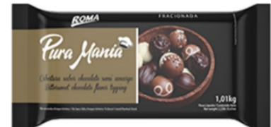
CÓD. 224 Pura Mania Semi Bitter Bar 1,01Kg Box 10 units