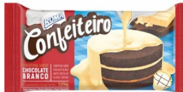
CÓD. 462 - Confeiteiro white bar 1,01Kg Box 10 units