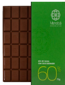
Cocoa and Coco only | Gluten Free • Preservative Free • Lactose Free 75g and 25g