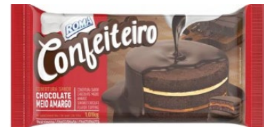
CÓD. 461 - Confeiteiro Semi Bitter Bar 1,01Kg Box 10 units