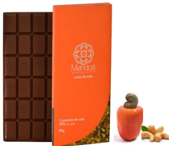
Chocolate 40% cocoa with cashews 80g and 25g