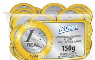
CÓD. 101 - 1 Real Coins 350g CÓD. 102 - 1 Real Coins 150g Box 24 units