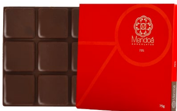
70% cocoa chocolate | gluten free • lactose free 75g and 25g