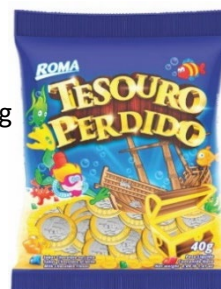
CÓD. 103 Lost Treasure 40g Box 30 pc