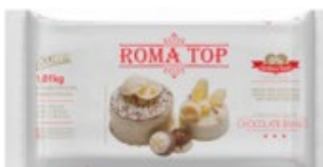
CÓD. 1371 - Roma Top white bar 1,01Kg Box 10 units