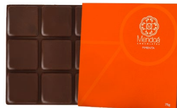
Chocolate 70% cocoa with Pepper 75g and 25g