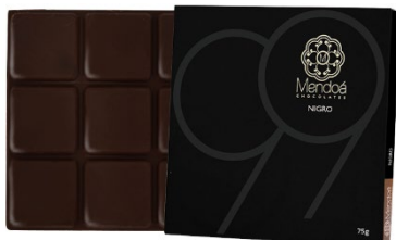
Chocolate 99% cocoa - Nigro 75g