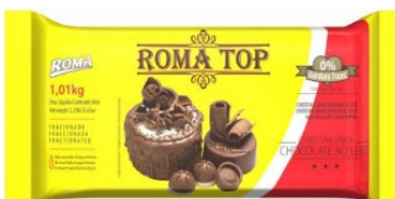
CÓD. 1370 - Roma Top to milk bar 1,01Kg Box 10 units