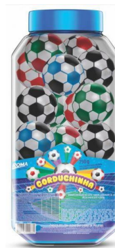
CÓD. 1929 - Gorduchinha 750g Box 6 units