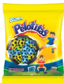
CÓD. 803 Pelotitas 300g Box 24 pc