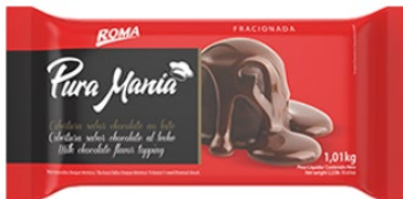
CÓD. 459 Pura Mania to milk bar 1,01Kg Box 10 units