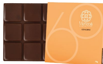
Chocolate 60% cocoa with ginger 75g and 25g