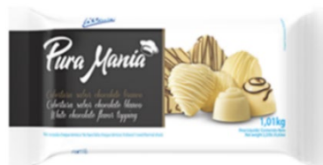
CÓD. 054 Pura Mania white bar 1,01Kg Box 10 units