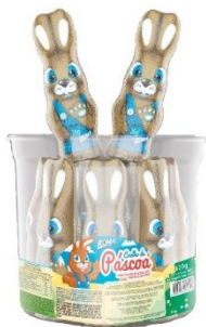
CÓD. 1883 - Easter Bunny Pot 420g Box 6 units