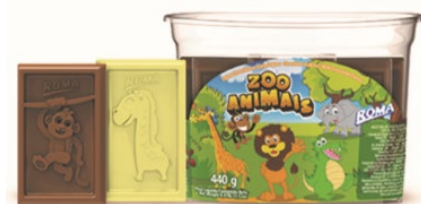
CÓD. 1920 - Zoo Animals to milk and White 440g Box 12 units