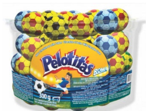
CÓD. 029 Pelotitas Pot 300g CÓD. 162 Pelotitas Pot 510g CÓD. 005 Pelotitas Pot 600g Box 24/12/12 units