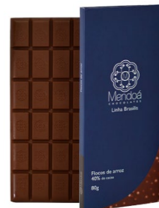
40% cocoa chocolate with 75g and 25g rice flakes