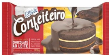
CÓD. 460 - Confeiteiro to milk bar 1,01Kg Box 10 units