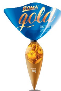
CÓD. 1803 – Gold Carrot to Milk 90g Box 30 units