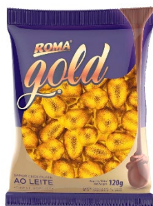
CÓD. 1990 Small eggs Gold to milk 120g Box 40 pc