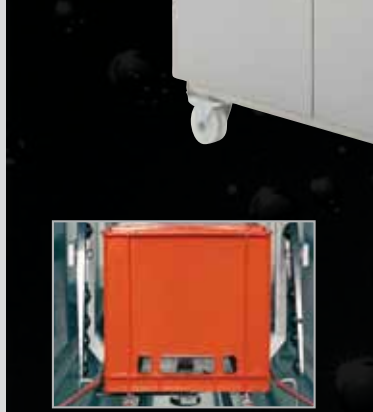
Conveyor system For a secure feeding of crates.