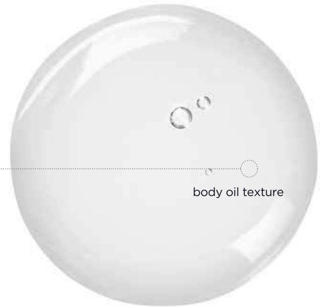
body oil texture