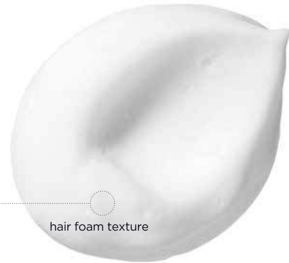
hair foam texture