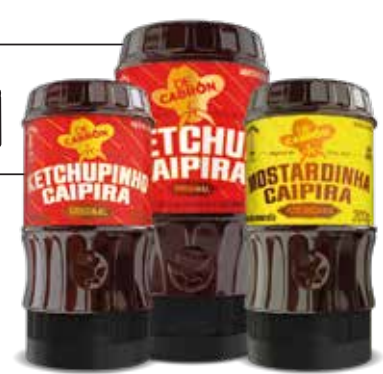
Hickory Ketchup/ Little Ketchup Original