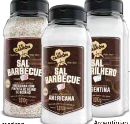
American Barbecue Salt