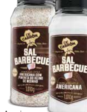
American Barbecue Salt with Black Pepper