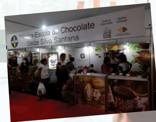
Fair - Chocolate/Cocoa Sector