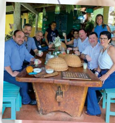
Technical visit - Cocoa Farm