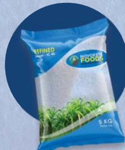
SUGAR - IC45