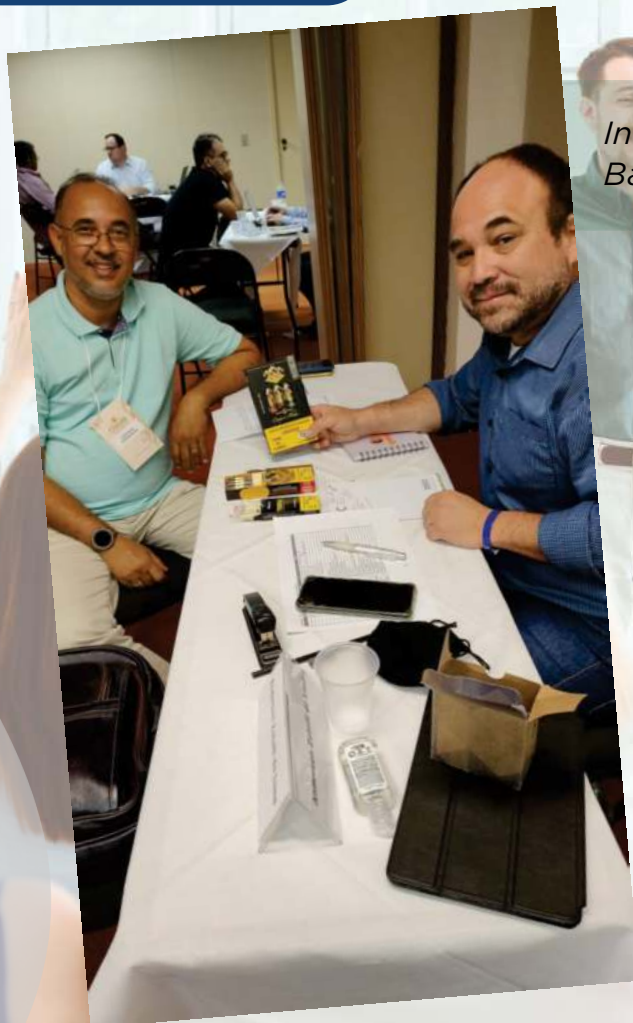
International Chocolate and Cocoa Festival - Chocolat Bahia 2022 - Tobacco sector