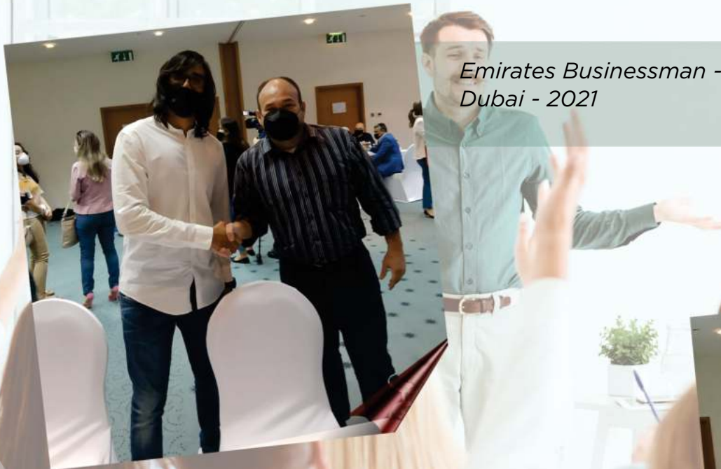
Emirates Businessman - Mini-market supply sector - Dubai - 2021