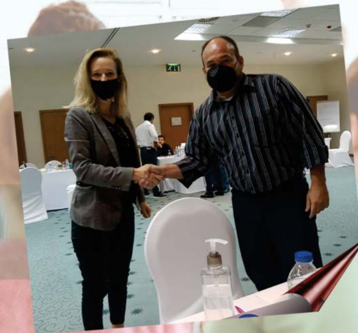
Commercial Representative for the Hotel Sector Emirates Food Purchasing - Dubai 2021