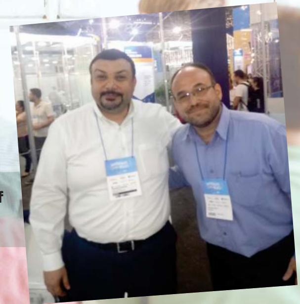
Sr. Mohamed Elkhatib - Commercial Consul of Embassy of the Arab Republic of Egypt.