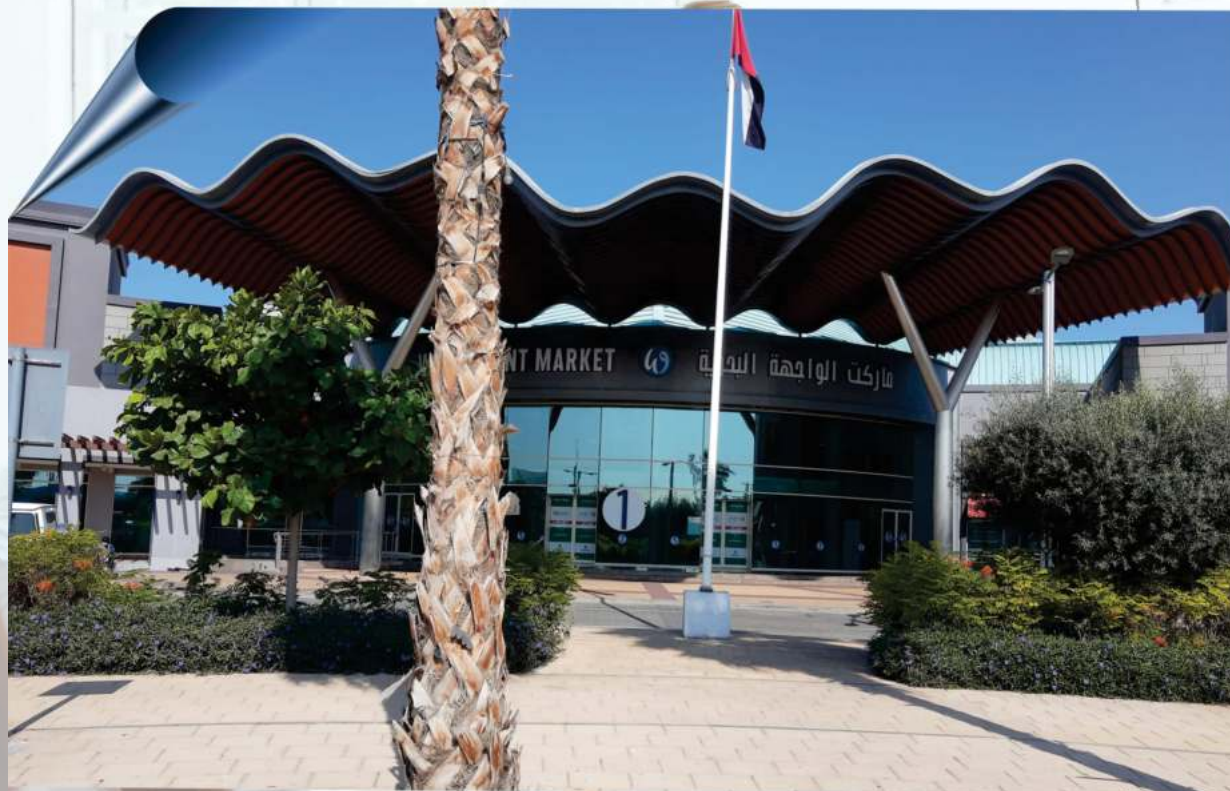
Waterfront Market (Waterfront Market LLC., Deira Enrichment Project, Al Khaleej Road, Dubai, UAE, Dubai, Emirados Árabes Unidos)