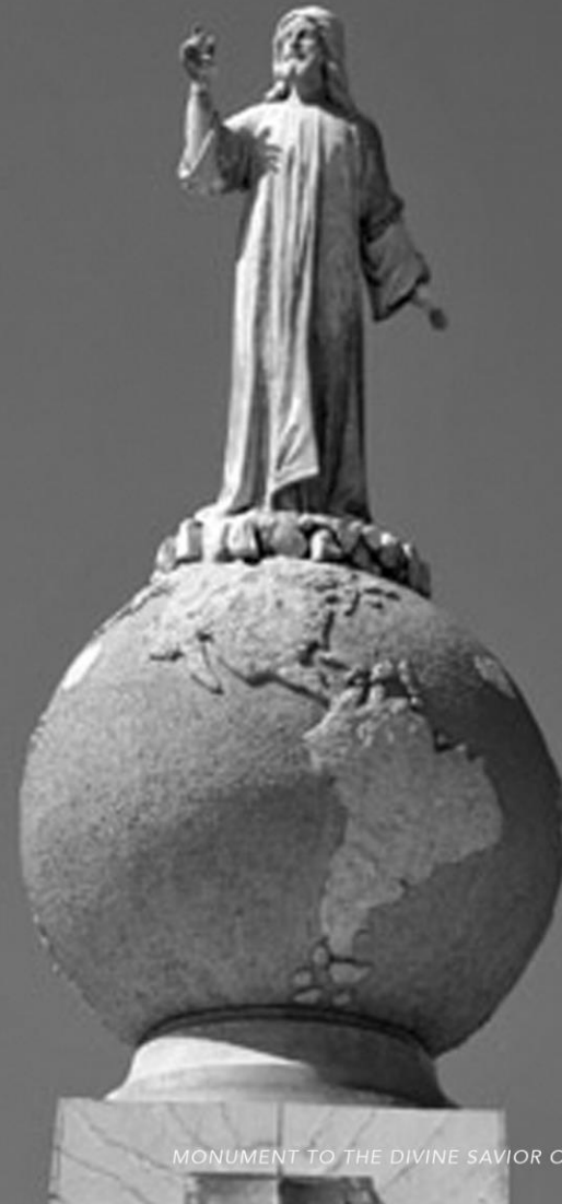
MONUMENT TO THE DIVINE SAVIOR OF THE WORLD – EL SALVADOR