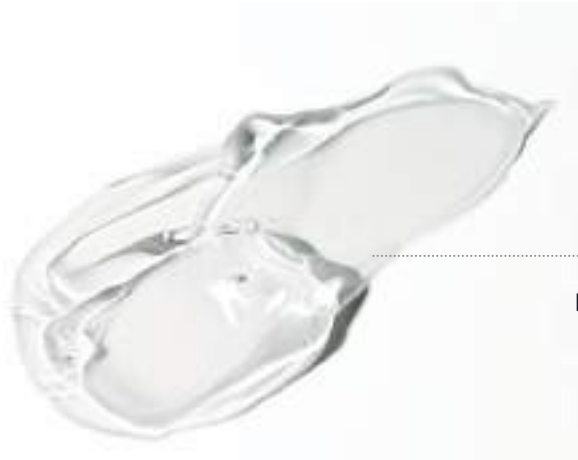
hair gel texture