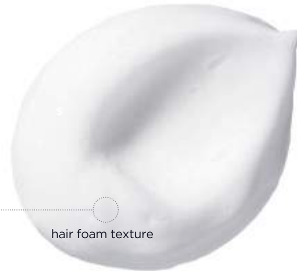
hair foam texture