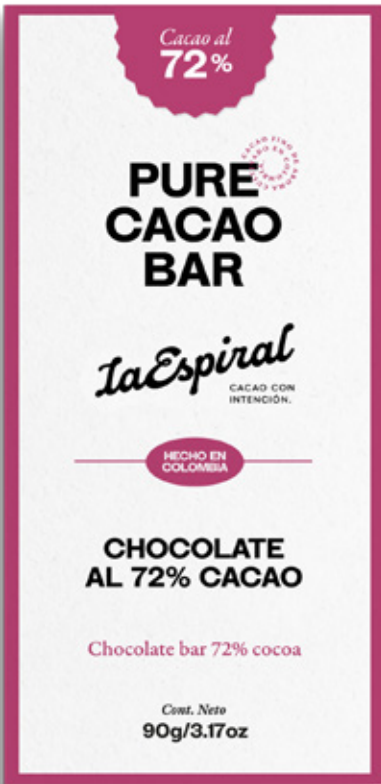
Chocolate Bar 72% Cocoa Net cont. 90g / 3.17 oz