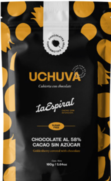
Goldenberry covered with chocolate Net cont. 160g / 5.64oz