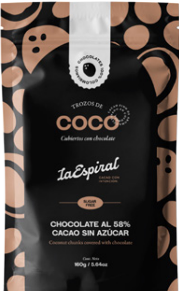
Coconut chunks covered with chocolate Net cont. 160g / 5.64oz