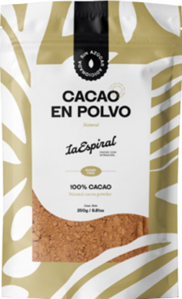
Natural cocoa powder Net cont. 250g / 8.81oz