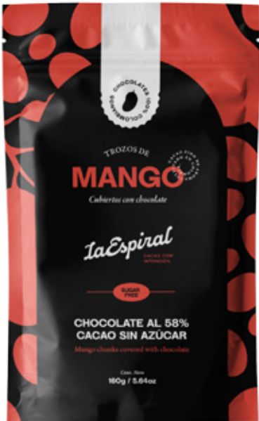
Mango chunks covered with chocolate Net cont. 160g / 5.64oz