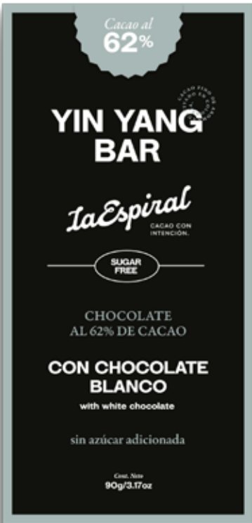
YIN YANG BAR / 62% With white chocolate