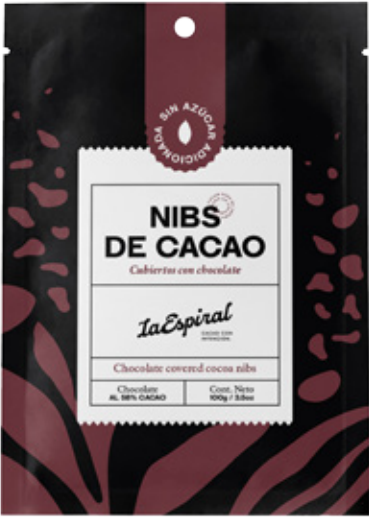
Cocoa nibs covered with chocolate Net cont. 100g / 3.5oz