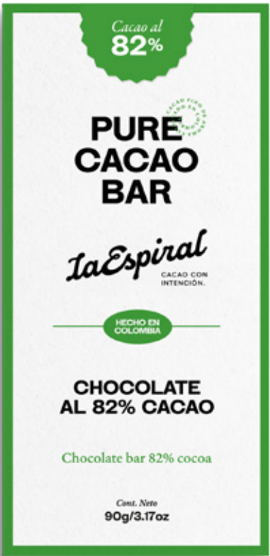
Chocolate Bar 82% Cocoa Net cont. 90g / 3.17 oz