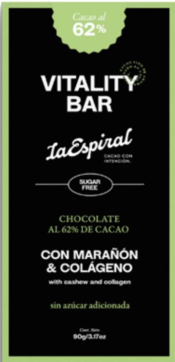
VITALITY BAR / 62% With cashew & collagen