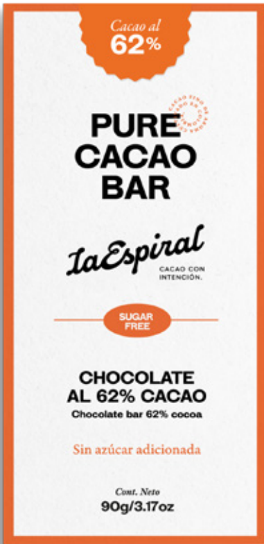
Chocolate Bar 62% Cocoa Net cont. 90g / 3.17 oz