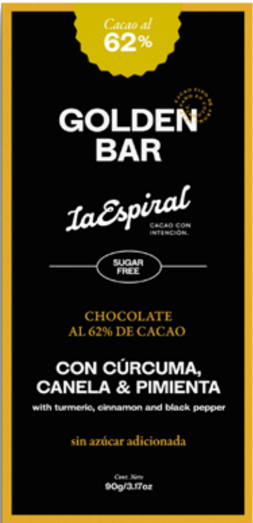
GOLDEN BAR / 62% With turmeric, cinnamon & black pepper