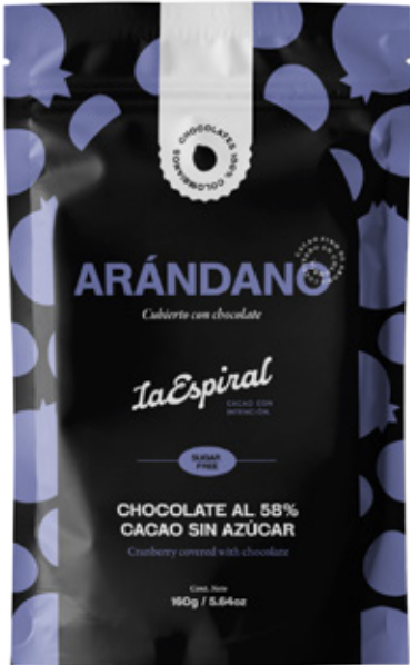
Cranberry covered with chocolate Net cont. 160g / 5.64oz