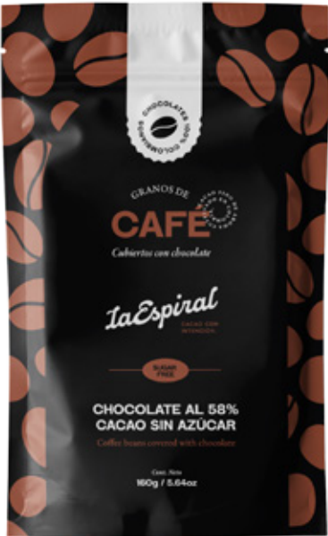
Coffee beans covered with chocolate Cont. neto 160g / 5.64oz