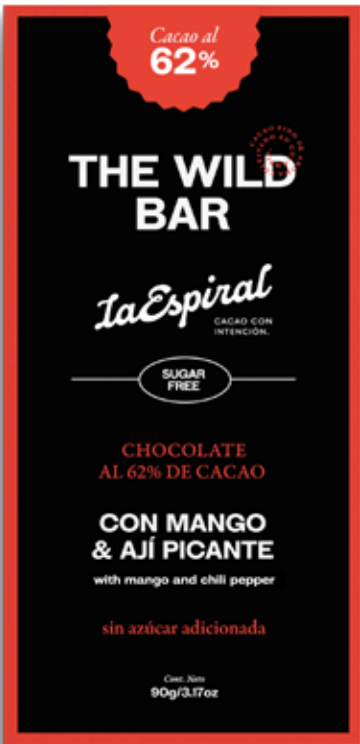
THE WILD BAR / 62% With mango & chill pepper