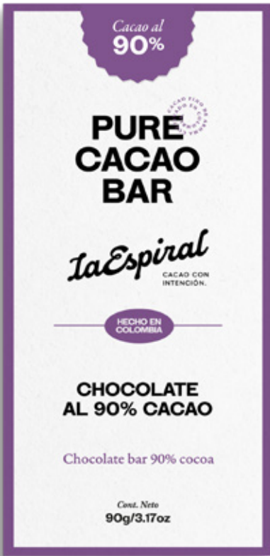
Chocolate Bar 90% Cocoa Net cont. 90g / 3.17 oz