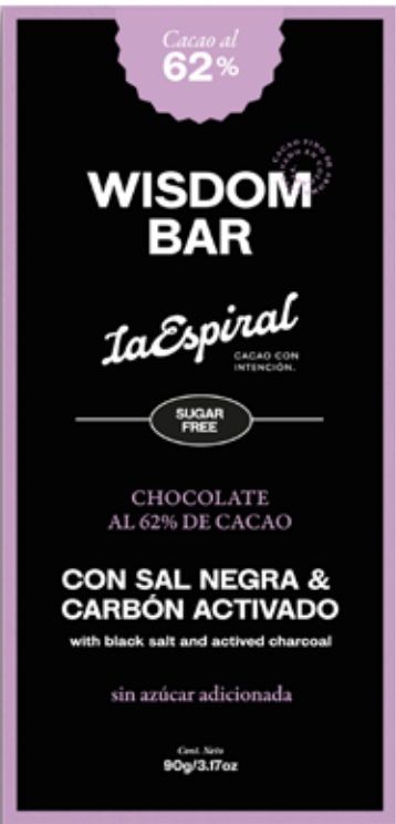
WISDOM BAR / 62% With black salt & activated charcoal