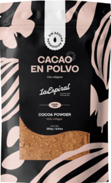
Cocoa powder with collagen Net cont. 250g / 8.81oz