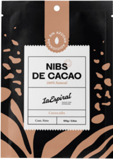
Cocoa nibs 100% Natural Net cont. 100g / 3.5oz