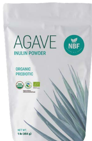
Organic Agave Inulin