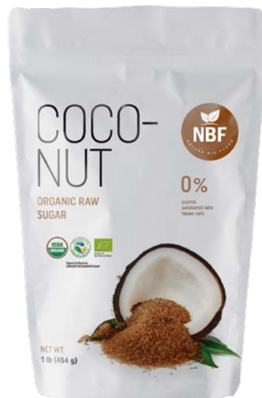
Organic Coconut Sugar