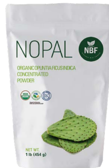
Dehydrated Nopal Powder (Cactus powder)