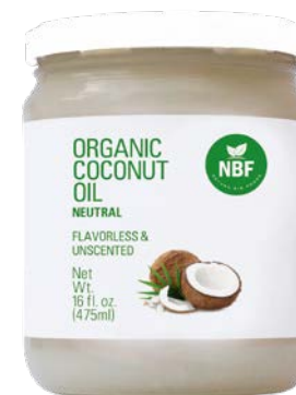
Organic Neutral Coconut Oil