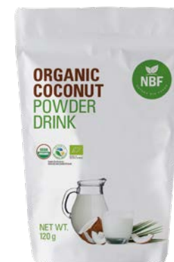
Organic Coconut Powder Drink