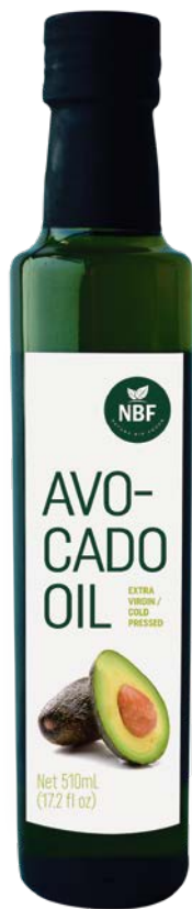
Extra Virgin Avocado Oil