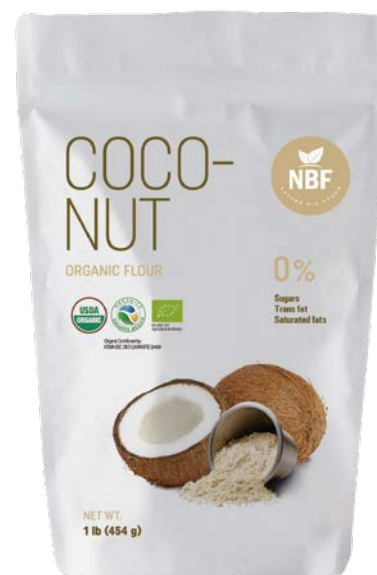
Organic Coconut Flour