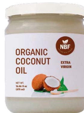
Organic Extra Virgin Coconut Oil