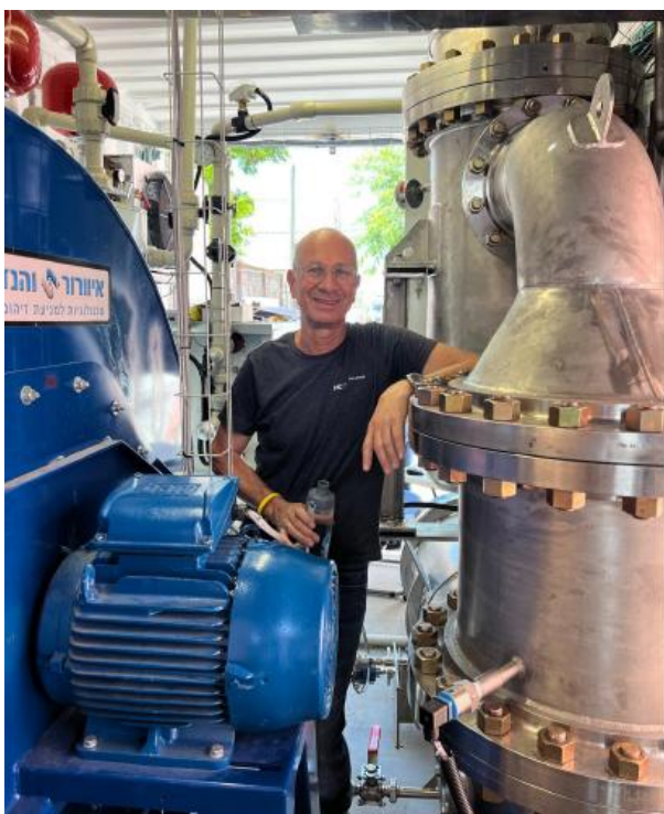
Commercial system: 1,000 Liters/day

1000 liter/day • High quality water • 80% cheaper than alternatives • Plug & Play at the point of use • Replacing bottled water • Sustainable • Simple maintenance