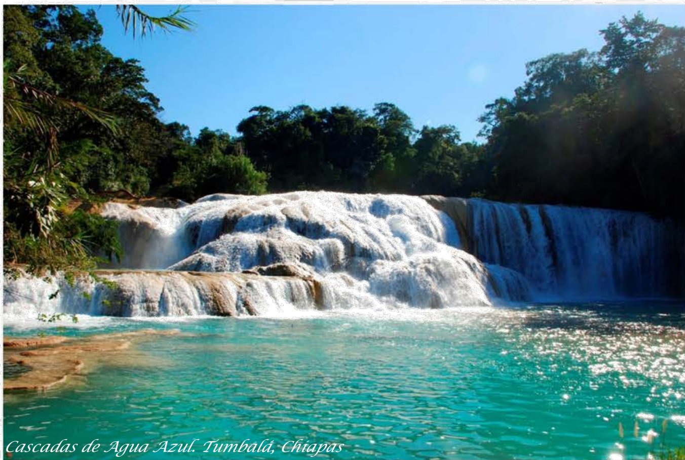
Cascadas de Agua Azul, Tumbalá, Chiapas