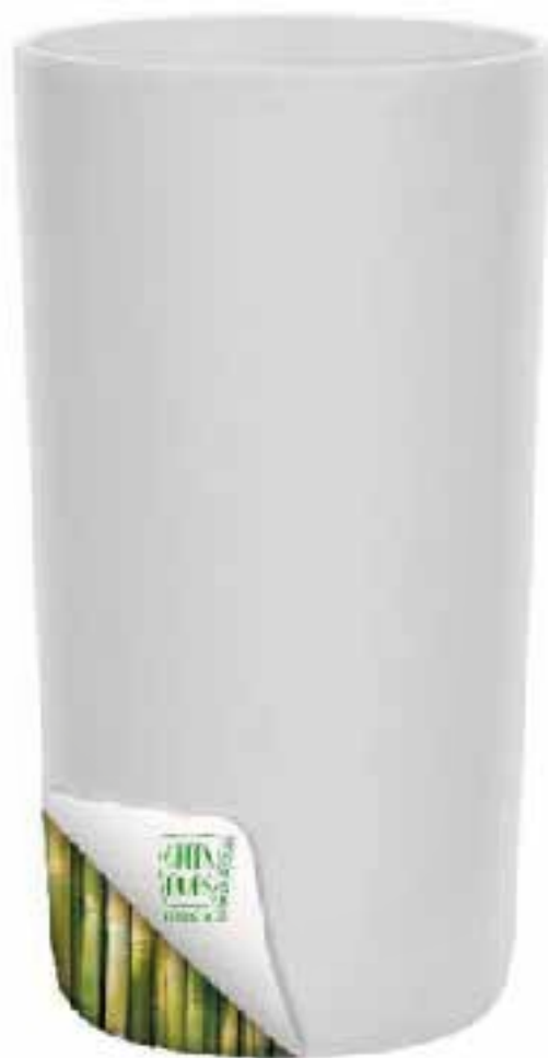
Green Cups 280ml

https://www.greencups.com.br/calculadoradaeconomia