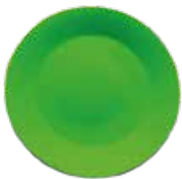
Eco-friendly plate 18 cm Green Cups®

Code: CRM130GCVD Diameter: 10 cm Height: 5,5 cm Weight: 31 g