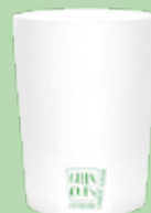
Eco-friendly Cup 320ml Green Cups® White

Code: LD280GCBR Diameter: 6,5 cm Height: 11,7 cm Weight: 40 g