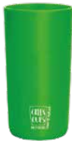
Eco-friendly Cup 500ml Green Cups®

Code: CD360GCLVD Diameter: 8 cm Height: 12 cm Weight: 50 g