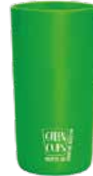
Eco-friendly Cup 280ml Green Cups®

Code: SD200GCLVD Diameter: 6 cm Height: 9 cm Weight: 30 g