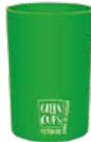
Eco-friendly Cup 200ml Liso Green Cups®

Code: SD200GCVD Diameter: 6,5 cm Height: 9 cm Weight: 35 g