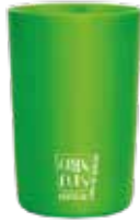
Eco-friendly Cup 200ml Texturizado Green Cups®

Code: TE70GCVD Diameter: 5 cm Height: 6,3 cm Weight: 20 g