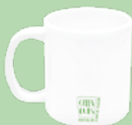
Eco-friendly Mug 300ml Green Cups® White

Code: BD500GCBR Diameter: 7,5 cm Height: 14,5 cm Weight: 75 g