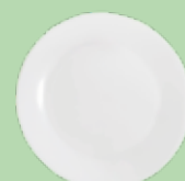
Eco-friendly plate 18 cm Green Cups® White

Code: CRM130GCBR Diameter: 10 cm Height: 5,5 cm Weight: 31 g