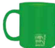
Eco-friendly Mug 300ml Green Cups®

Code: BD500GCVD Diameter: 7,5 cm Height: 14,5 cm Weight: 75 g