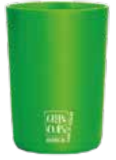
Eco-friendly Cup 320ml Green Cups®

Code: LD280GCVD Diameter: 6,5 cm Height: 11,7cm Weight: 40 g