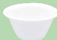
Eco-friendly Cream jug 130 ml Green Cups® White

Code: RAM90GCBR Diameter: 7 cm Height: 4,2 cm Weight: 16 g