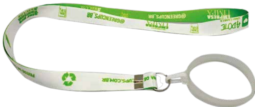
Green Cups® Lanyard with Silicone Cup Holder