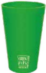
Eco-friendly Cup 360ml Green Cups®

Code: BD320GCVD Diameter: 7,2 cm Height: 10 cm Weight: 50 g