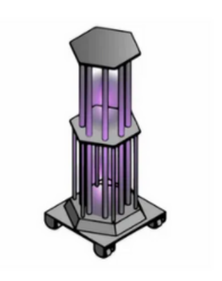
Designed for the disinfection of surfaces in hospital environments, care rooms, transport systems, buses, trains and high traffic areas