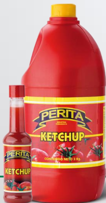
Classic Ketchup of 150g and 3kg