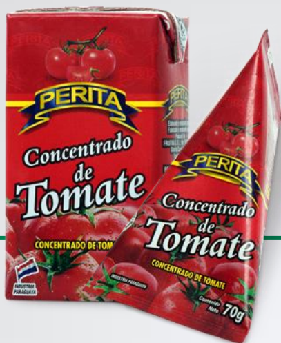
TOMATO CONCENTRATED Presentations 140g and 70g / Tetra Pak