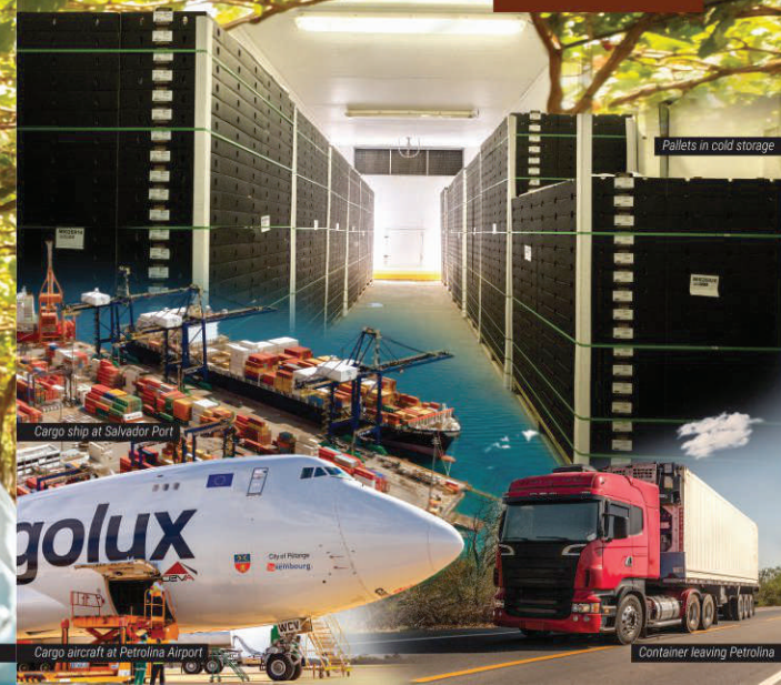
Pallets in cold storage

Fresh fruit all year round for our customers.