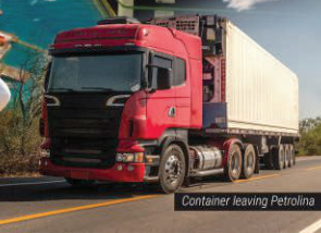
Container leaving Petrolina