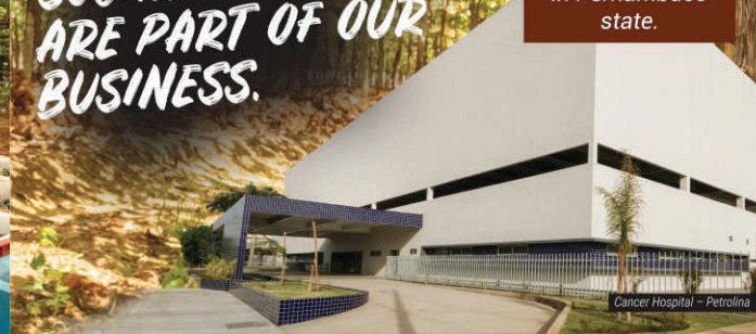
Cancer Hospital - Petrolina

We contribute to the 4th largest charitable organization in Pernambuco state.