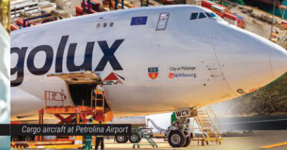
Cargo aircraft at Petrolina Airport