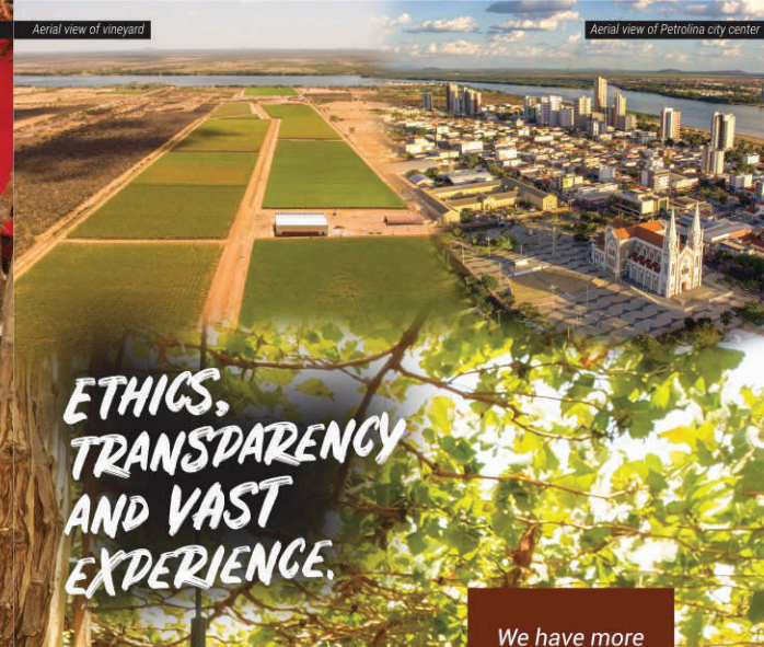
Aerial view of vineyard

ETHICS, TRANSPARENCY AND VAST EXPERIENCE.