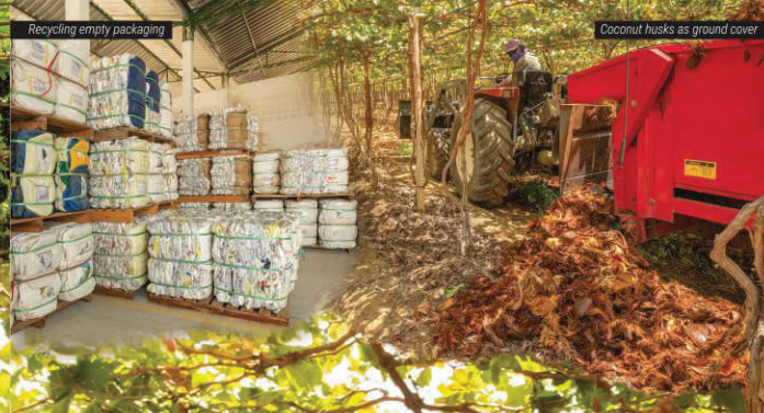
Recycling empty packaging