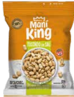
UNSALTED ROASTED PEANUT