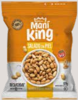
SALTED PEANUT WITHOUT SKIN