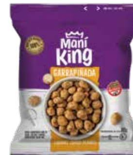
SUGAR COATED PEANUT