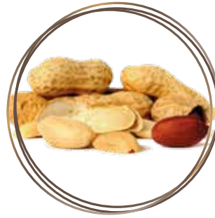
ROASTED PEANUT IN-SHELL