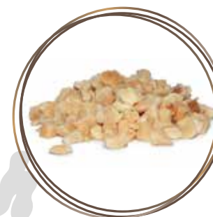
ROASTED CHOPPED PEANUT