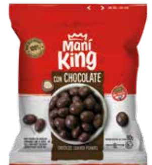
CHOCOLATE COATED PEANUT