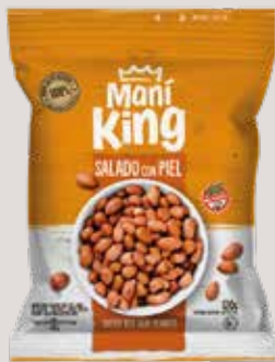
SALTED PEANUT WITH SKIN