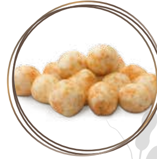
CRUNCHY FLAVORED PEANUT