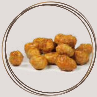
SUGAR COATED PEANUT