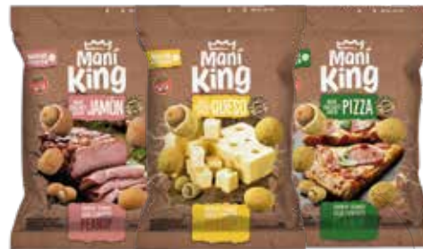
CRUNCHY FLAVORED PEANUT