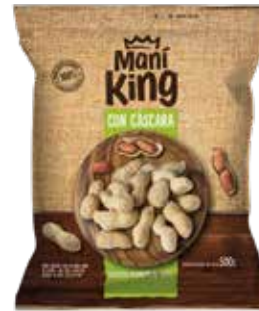
ROASTED PEANUT IN-SHELL