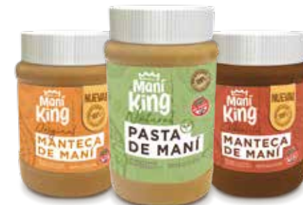
PEANUT PASTE AND BUTTER