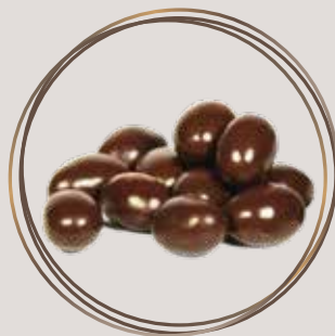
CHOCOLATE COATED PEANUT