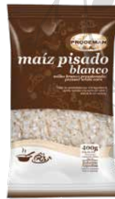
WHITE HOMINY CORN