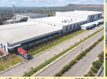
Jain Food Park, Jain Valley, Jalgaon (MS) India Spice Processing