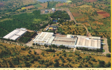
Jain Food Park, Jain Valley, Jalgaon (MS) India Fruit Processing