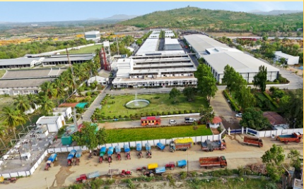
Jain Food Park - 1, Chittoor (AP) India Fruit Processing