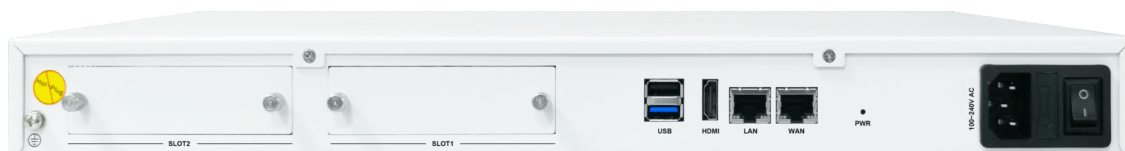
T-600 | 600 extensions | 150 concurrent calls | expandable