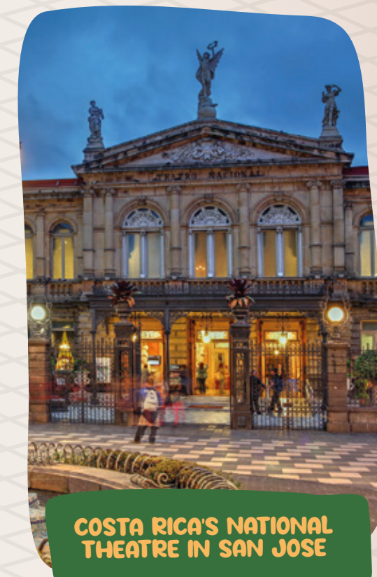
COSTA RICA'S NATIONAL THEATRE IN SAN JOSE

Immerse yourself in the vibrant Afro-Caribbean culture of Costa Rica. This 3-day journey includes a culinary class, local encounters, and relaxing moments by the beach — blending flavor, rhythm, and ancestral pride.