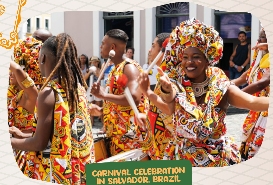
CARNIVAL CELEBRATION IN SALVADOR, BRAZIL

Live Salvador's legendary Carnival from an exclusive perspective. This premium experience combines cultural immersion, curated access to Afro blocos, and private viewing spaces — connecting the energy of celebration with the roots of Afro-Brazilian identity.