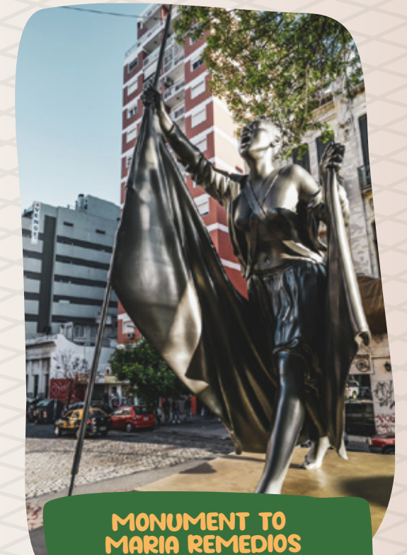
MONUMENT TO MARIA REMEDIOS DEL VALLE