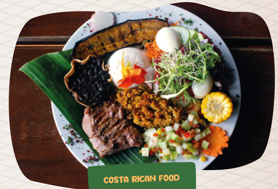
COSTA RICAN FOOD