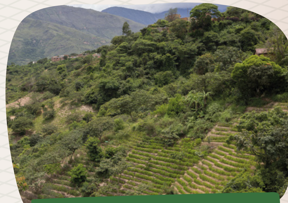
COCA LEAF PLANTATIONS IN THE YUNGAS REGION