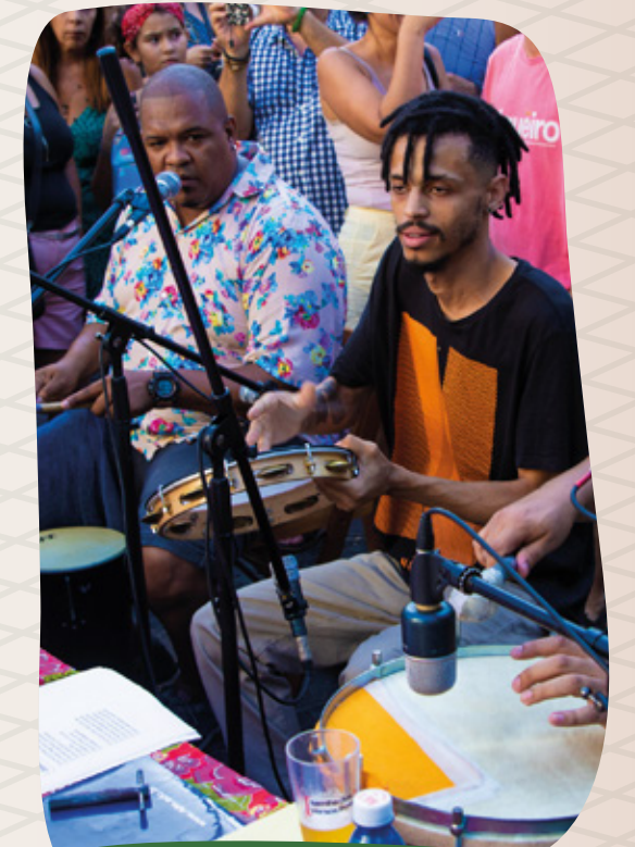
AUTHENTIC SAMBA EXPERIENCE IN RIO DE JANEIRO