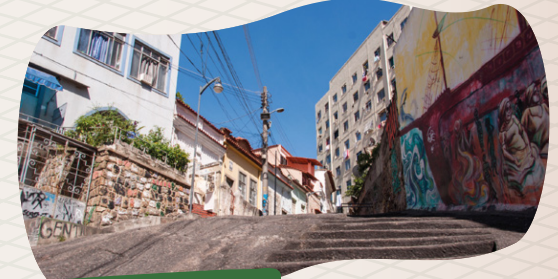
PEDRA DO SAL IN LITTLE AFRICA, RIO DE JANEIRO

Explore Rio de Janeiro through its African roots in this full-day journey across the Little Africa district. Visit key landmarks that honor Black resistance and cultural legacy, including the Valongo Wharf, the “Cais do Valongo” UNESCO site, and the Museu de História e Cultura Afro-Brasileira.