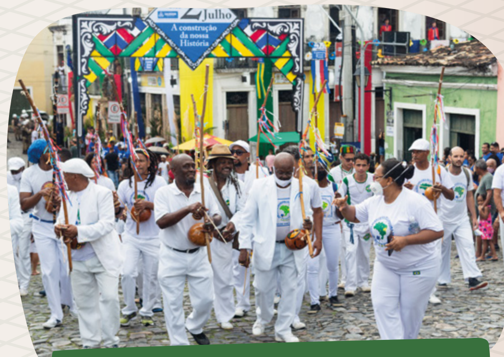
CAPOEIRA EXPERIENCES IN SALVADOR