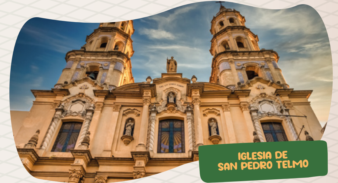
IGLESIA DE SAN PEDRO TELMO

Discover Buenos Aires through its hidden Afro-Argentine heritage on this walking tour led by Afro-Argentine guides. Explore the San Telmo district, visit the El Patio de Cabo Verde restaurant and the El Tambo Afro store, and uncover the stories of resistance and resilience that shaped the city's soul.