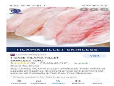
In 2021, the approximate price range for Uganda Fish is between US$ 1.96 and US$ 1.17 per kilogram or between US$ 0.89 and US$ 0.53 per pound (lb).

The price in Uganda Shilling is UGX 6998.35 per kg. The average price for a tonne is US $ 2300.