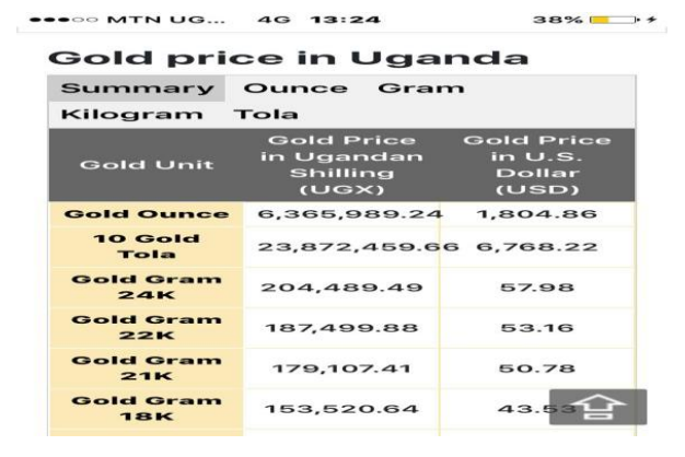
Especially for Fair trade Certified Gold unit.