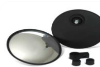
201 Master with Clamp Master Mirror with Clamp