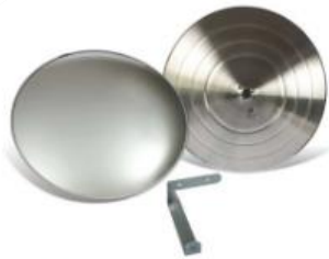
▲ Panoramic mirror Finish: Aluminum