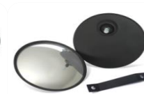
202 Master Supported Master Mirror Support