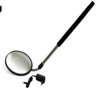
▲ 903 Vehicle Inspection Mirror