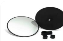
203 Magnum with Clamp Magnum mirror with clamp