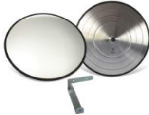
▲ Panoramic mirror Finish: Rubber