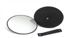
204 Magnum Supported Mirror Magnum Supported