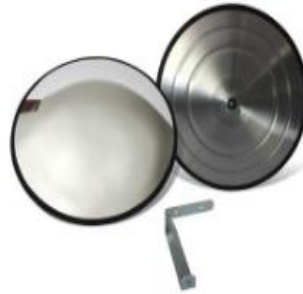
Parabolic Mirror ...