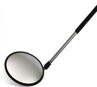
▲ 901 Vehicle Inspection Mirror