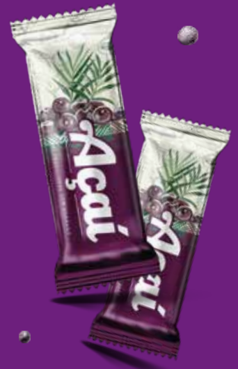
AÇAÍ POPSICLES traditional fruity guarana flavor