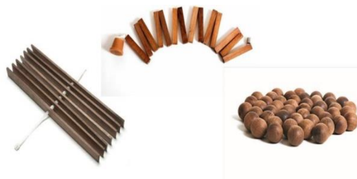
Other Consumables Xoakers, Barrel Insert, Xtrakit