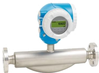
Grade Measurement Equipment Portable, visual and digital Refractometers. Millimetric stations for the grapes receptions, Flowmeters