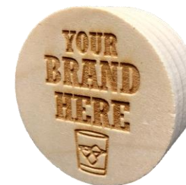
Bungs Designed according to client's needs and the company's logo