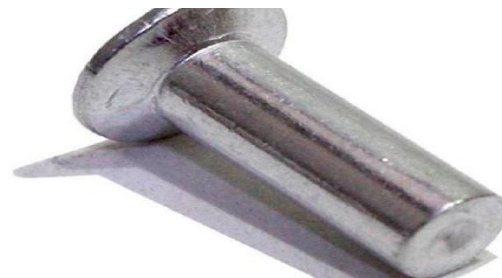
Rivets Countersunk Head Rivets, Flat Head Rivets)