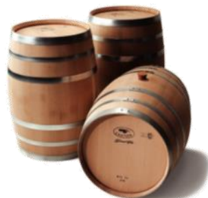
Barrels Bourbon, Scotch Barrels