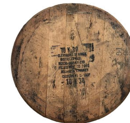
Heads and Bottoms Barrel Heads new or used, Plugs, Corks