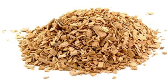
Chips Xtraok Chips , American Oak, French Oak