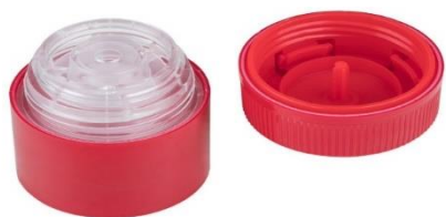
Plastic Caps for Beverages Wood Barrels and Tanks, Aspen Caps for Barrels, Canister, Labels and their Caps