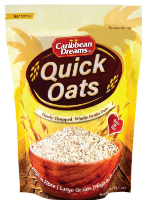
Quick Oats 24 x 200g 24 x 400g