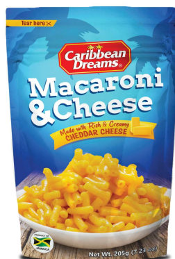
Macaroni & Cheese 24 x 205g