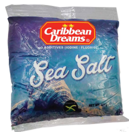
Sea Salt 25 x 400g