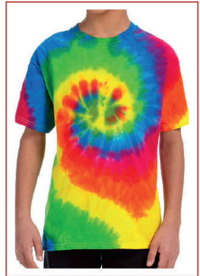
Tie Dye T Shirt