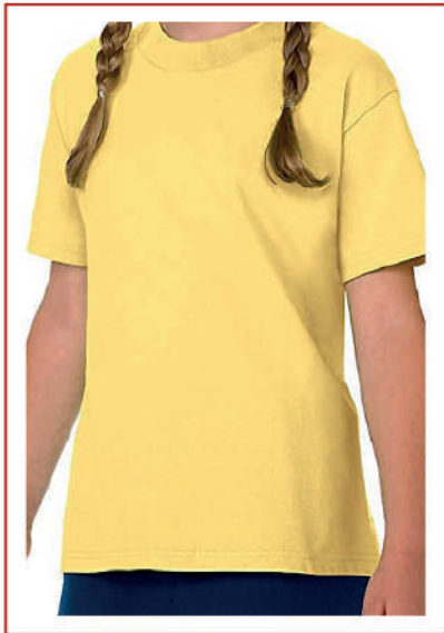
Pima T Shirt

The soft cotton tee breathes for consistent comfort.