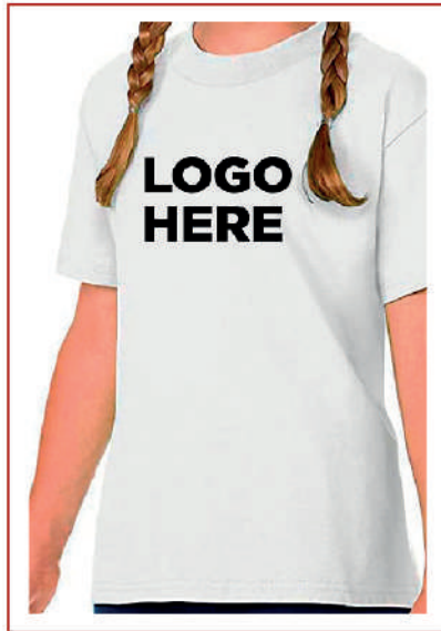
Pima print T-shirt

With 2-color print (logo on chest and back design)