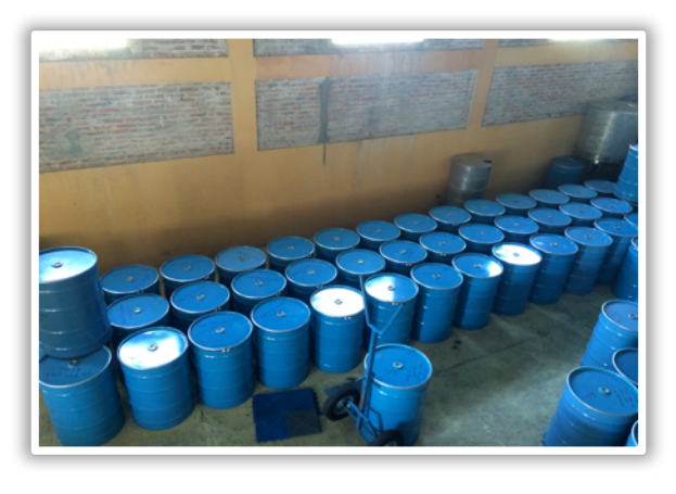
Organic Warehause in Tierras Coloradas – Uruguay.