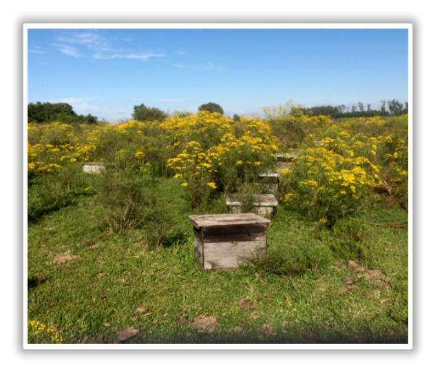
Beehives located in North Uruguay.

Pueblo Apícola produce with the caracter and dedication direct from the small producer located in Uruguay. The high level of knowledge and professionalism of the Beekepeers of the Company he made to obtain multiple international seals. We harvest every season Organic and Conventional Honey + FLO-FAIRTRADE.