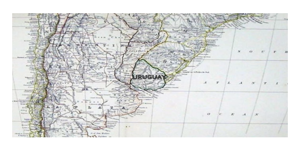
Apiaries on the North of the River Plate