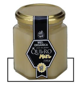
Organic Honey "Gluten Free". 500 grams