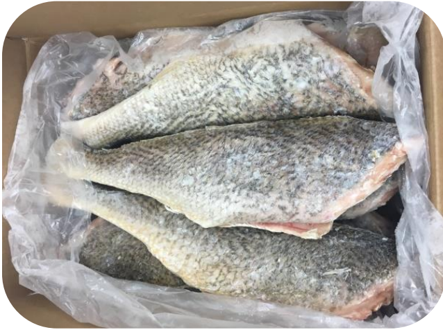
PAN READY IQF FROZEN BULK BOX