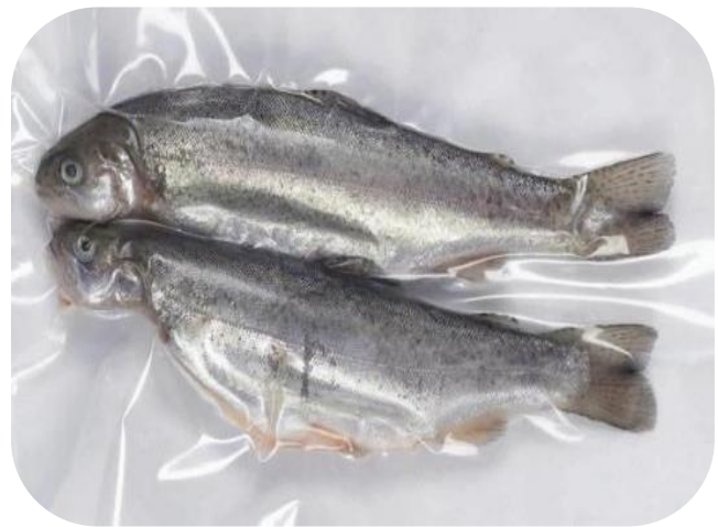
PACKING: WHOLE IQF FROZEN VACUUM PACK