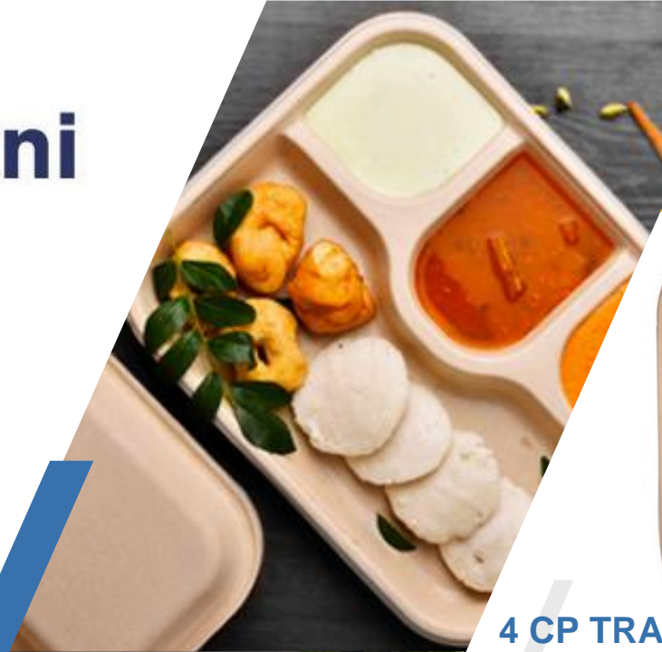
4 CP TRAY