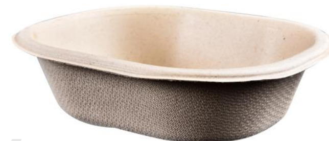
Bowl 180 ml