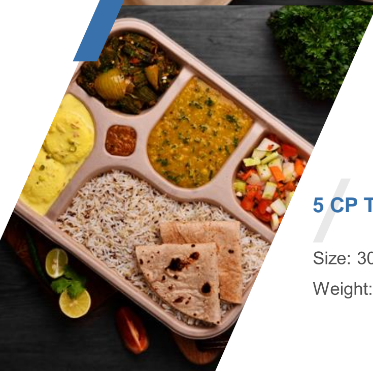
5 CP TRAY