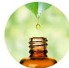
Essential Oil Murni