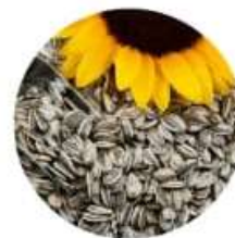
Vitamin E Sunflower Seed