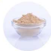
Clay Mineral DE