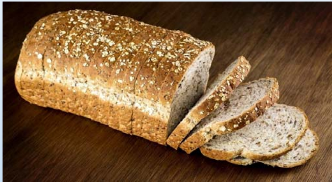
WHOLE GRAIN BREAD