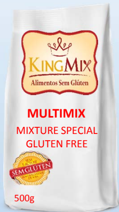
MULTI PURPOSE FLOUR