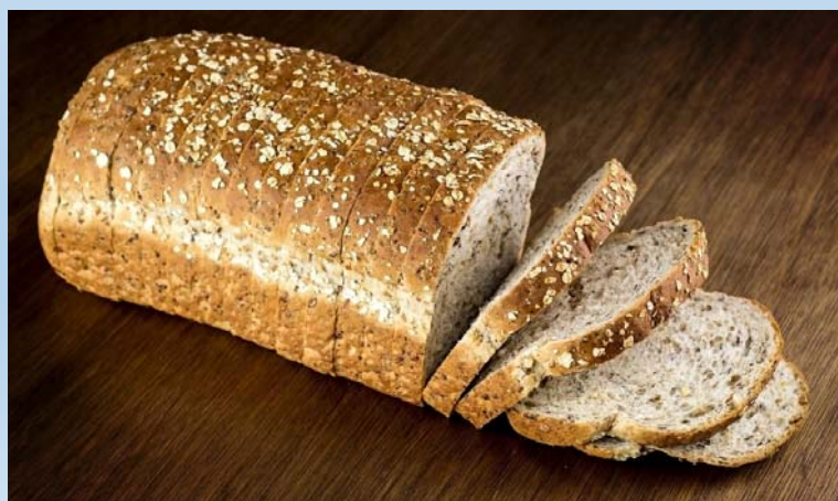
BREAD WHIT SEEDS