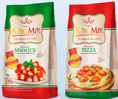
MIX FOR PASTAS