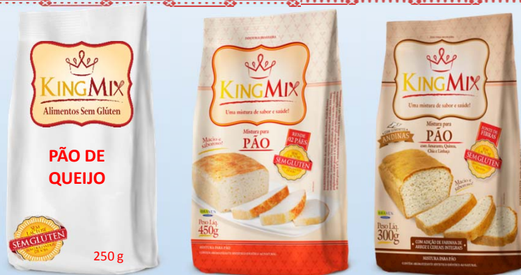
MIX FOR BREAD