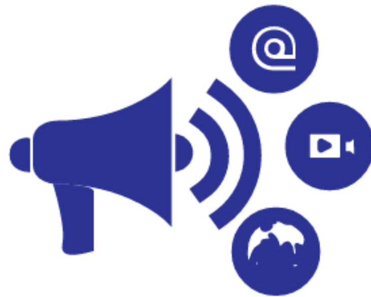
Social media strategy