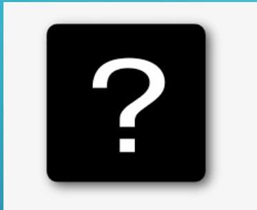
Executive (Asia Pacific Region)