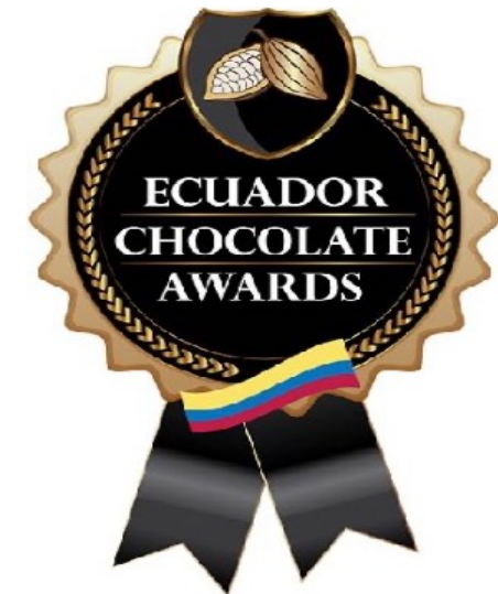
SILVER BAR 2016, 2017 & 2018 70% Organic Dark with Rosemary