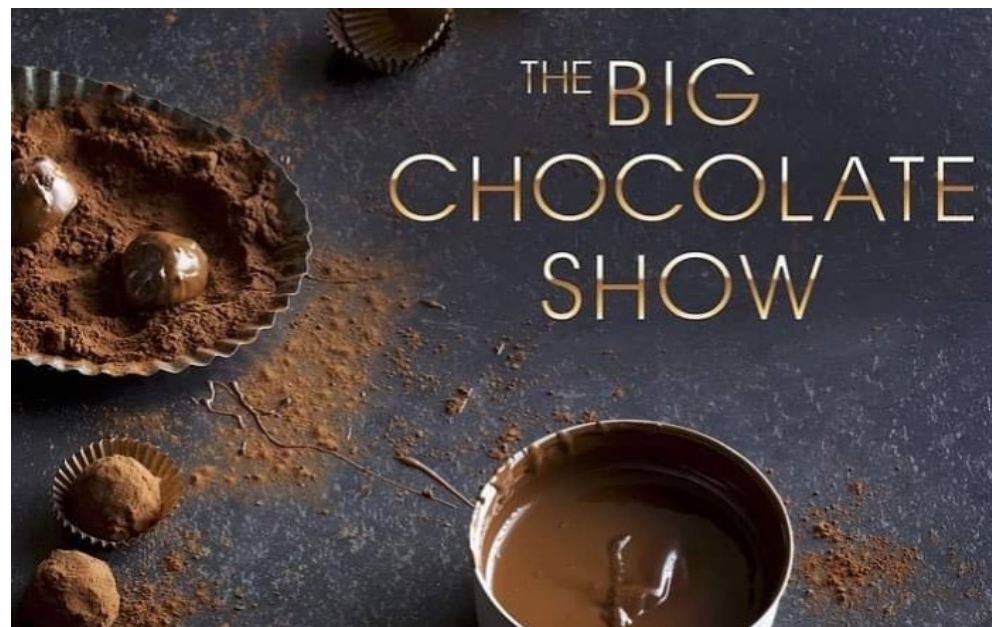
FAVE AWARD 2018