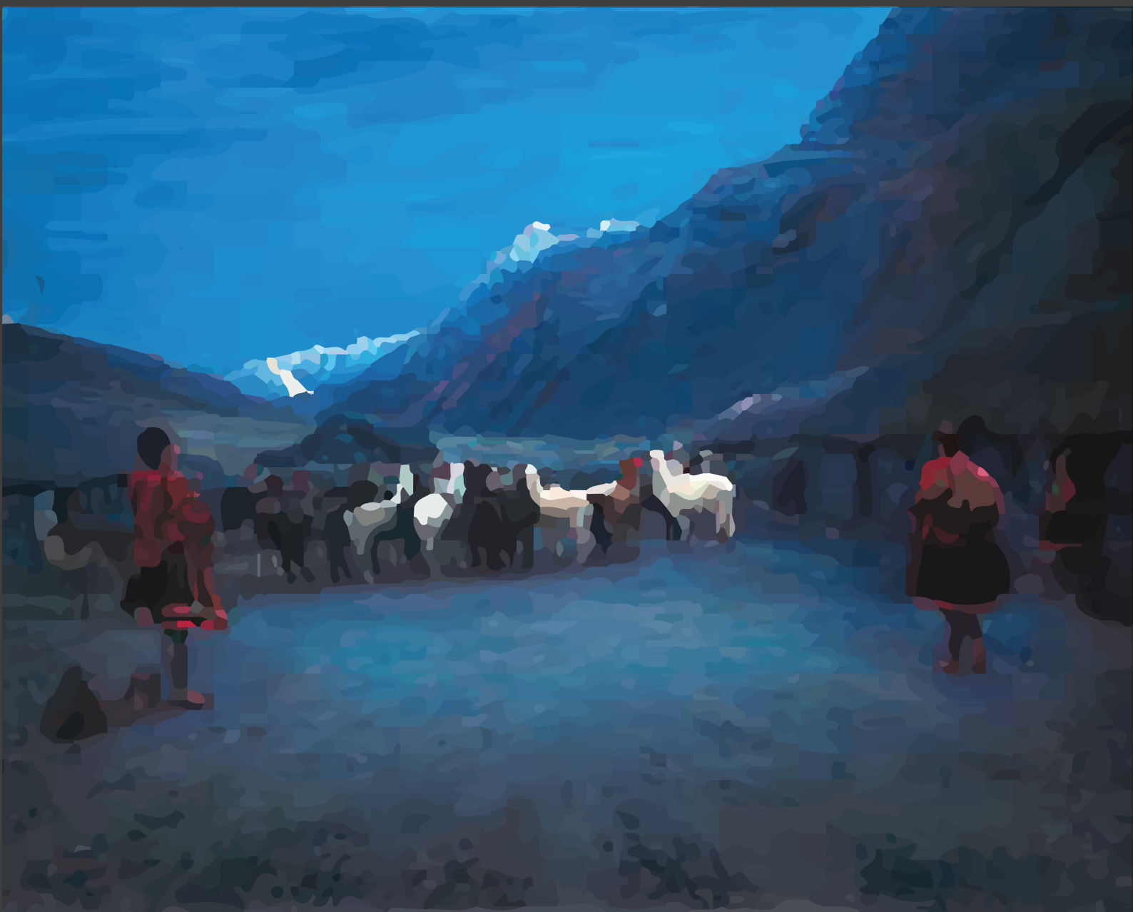
Alpacas en la noche / Alpacas in the night...