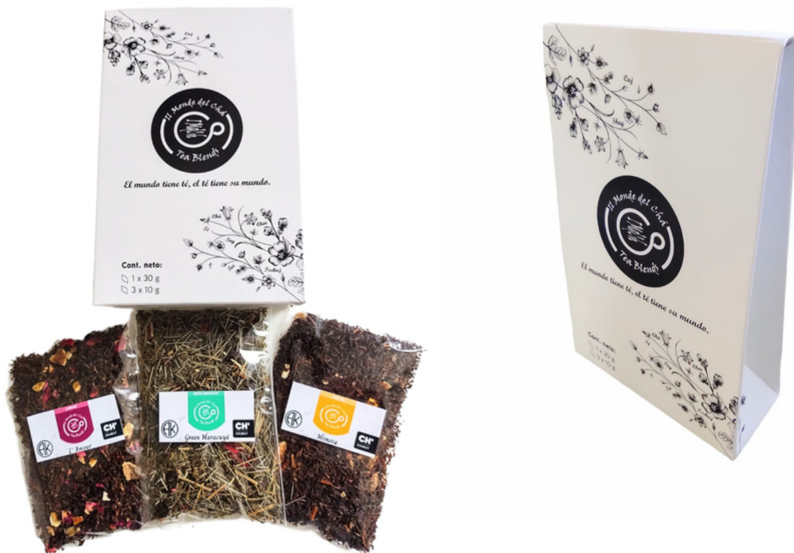
Loose leaf tea (BOP) in Box (3 different flavors)