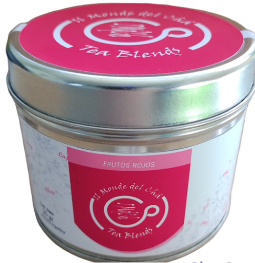
Loose leaf tea (BOP) tin 30 g