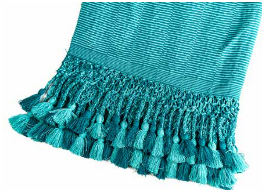
Sinú THROW Aqua REF: IST13A SIZE: 56 x 71 inches (140cm x 180cm)