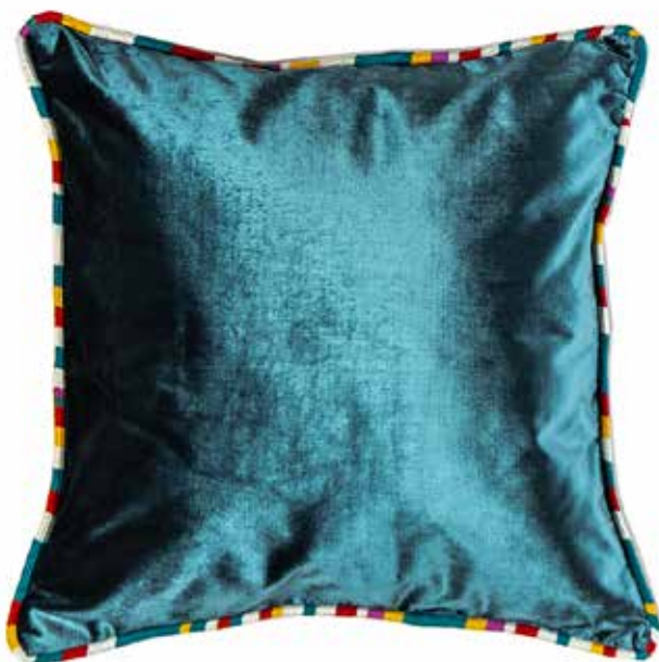
PILLOW SINU TERCIOPELO LARGE