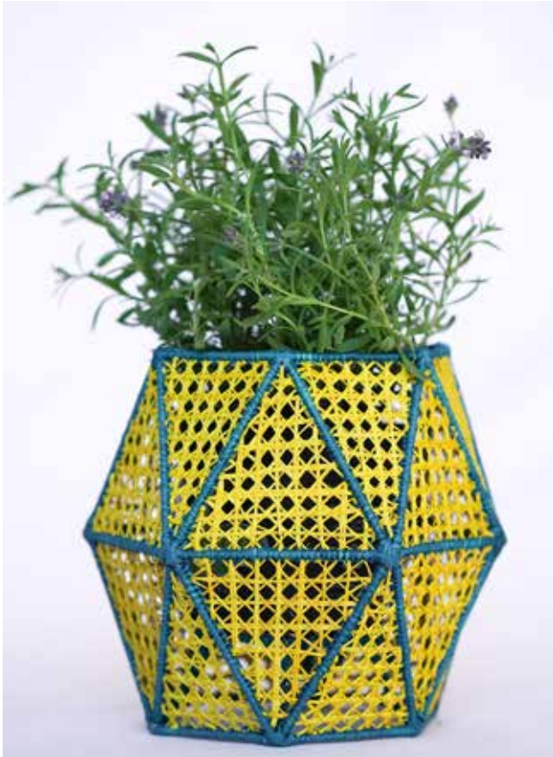
PITAYA REF: ISP15A/AZ SIZE: 6 x 8 inches (15 x 20 cm)