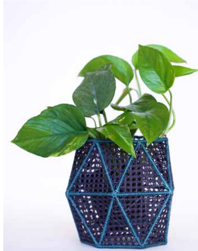
PITAYA REF: ISP15AZ/AZ SIZE: 6 x 8 inches (15 x 20 cm)