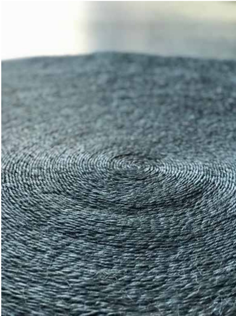
Circle Fique Grey