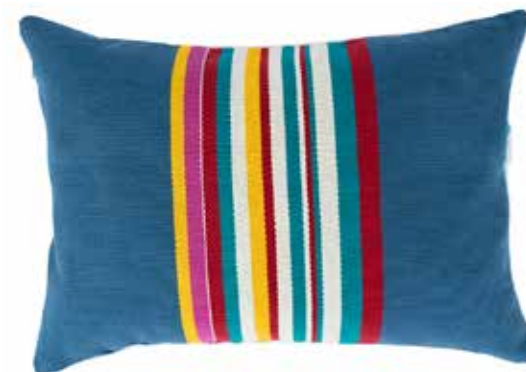
PILLOW SINU SOLIDA BLUE SMALL