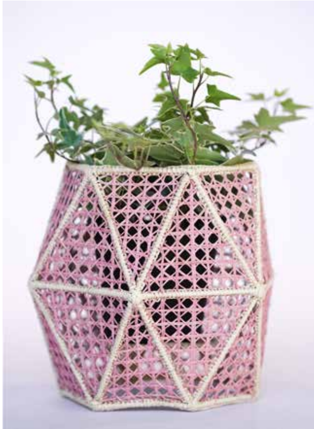
PITAYA REF: ISP15P/C SIZE: 6 x 8 inches (15 x 20 cm)