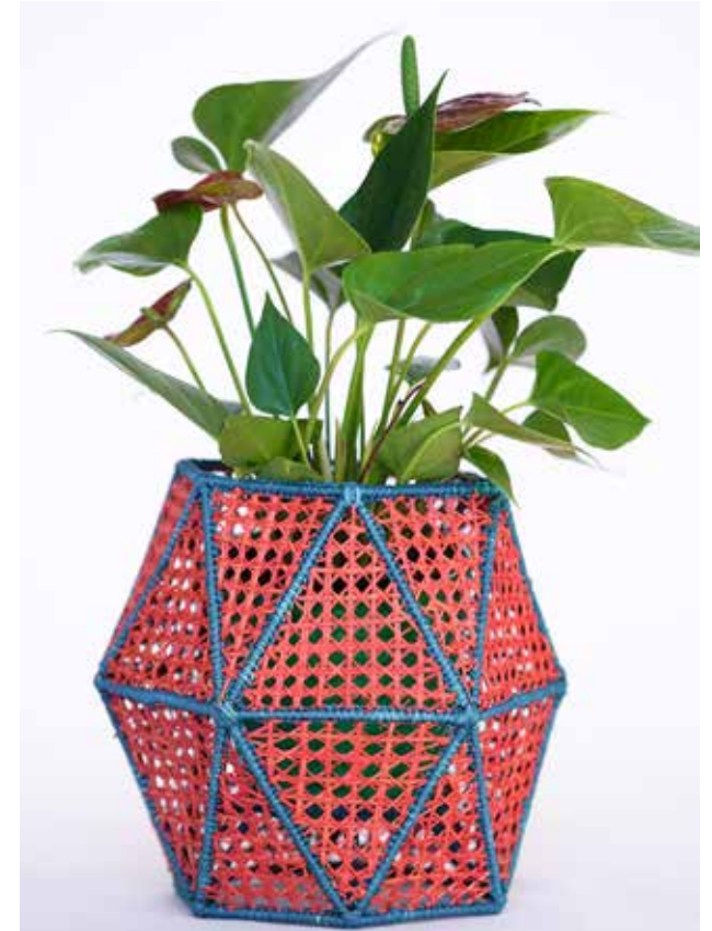
PITAYA REF: ISP15R/A SIZE: 6 x 8 inches (15 x 20 cm)