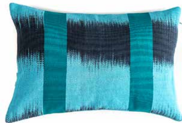
PILLOW SINU DEGRADE SMALL