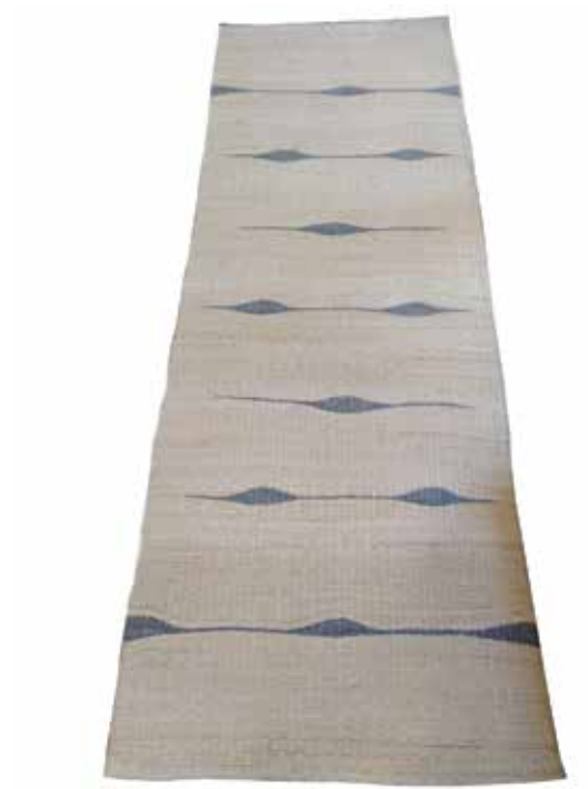
SIRI Sinú REF: SRL1Grey SIZE: 32 x 87 inches (80 cm x 220 cm)