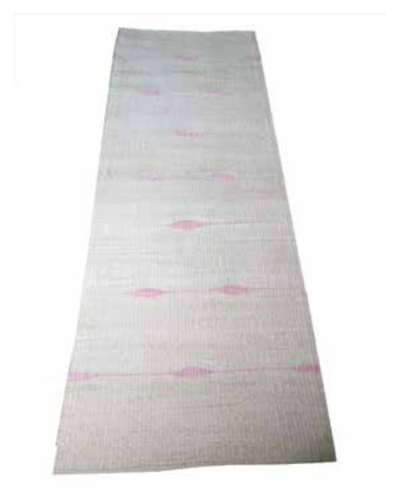
SIRI Sinú REF: SRL1Pink SIZE: 32 x 87 inches (80 cm x 220 cm)