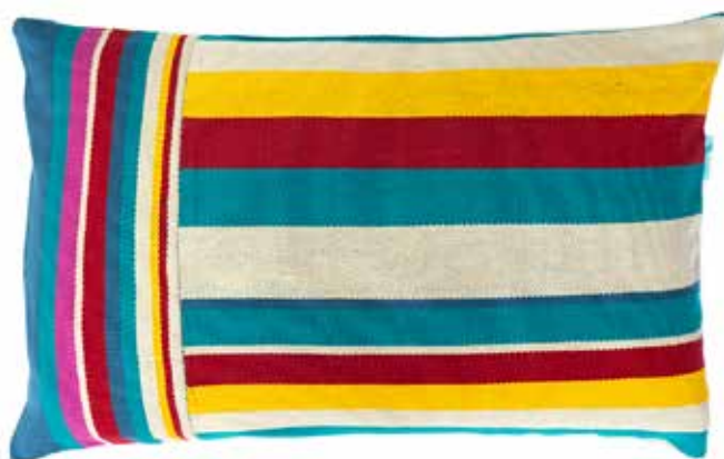
PILLOW SINU LINEAS MIX BLUE MEDIUM