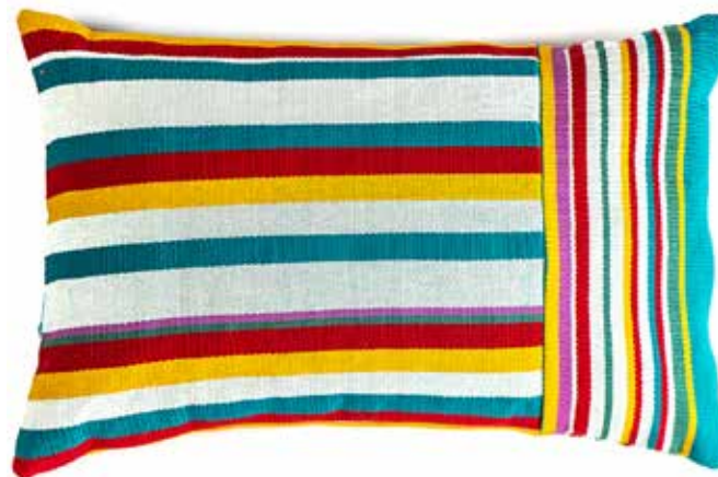
PILLOW SINU LINEAS MIX GREEN MEDIUM REF: ISPM02G SIZE: 16 x 24 inches (40 x 60 cm)