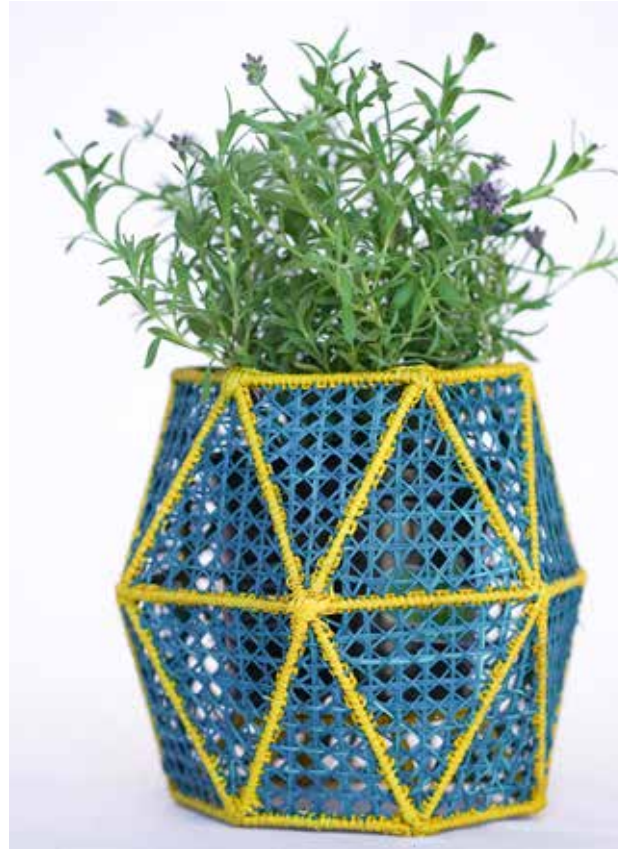
PITAYA REF: ISP15AZ/A SIZE: 6 x 8 inches (15 x 20 cm)