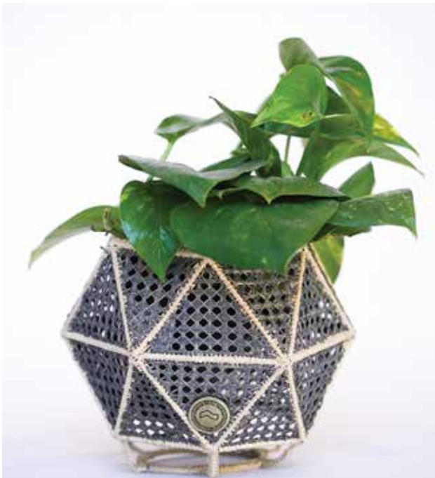
PITAYA REF: ISP15C/C SIZE: 6 x 8 inches (15 x 20 cm)