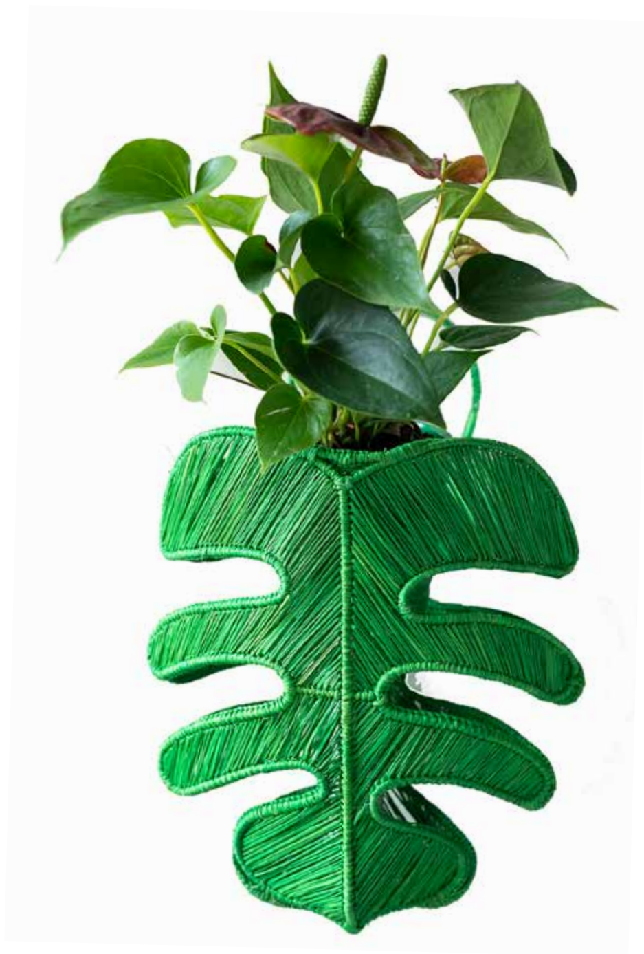
HOJA REF: ISP16HOJA SIZE: 6 x 8 inches (15 x 20 cm)