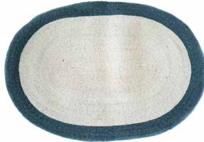
Ovala Figue Grey