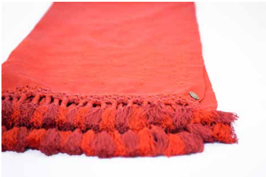
Sinú THROW Orange REF: IST14O SIZE: 56 x 71 inches (140cm x 180cm)