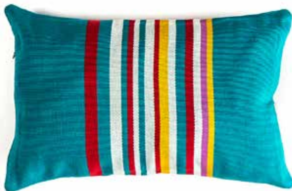
PILLOW SINU SOLIDA GREEN SMALL REF: ISPS03G SIZE: 13 x 18 inches (33 x 46 cm)