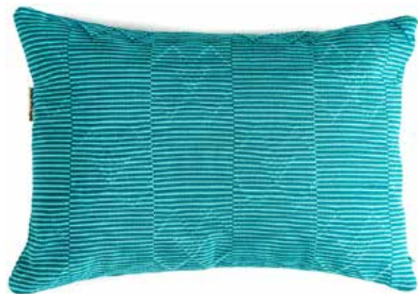
PILLOW SINU AGUA SMALL