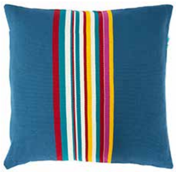
PILLOW SINU SOLIDA BLUE LARGE