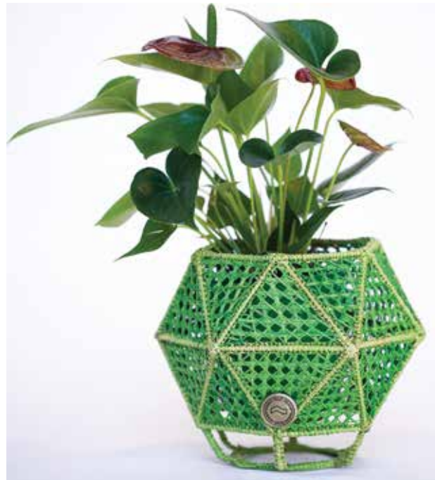
PITAYA REF: ISP15V/A SIZE: 6 x 8 inches (15 x 20 cm)