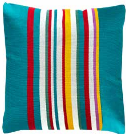
SINU SOLID GREEN LARGE REF: ISPL01G SIZE: 20 X 20 inches (50 x 50 cm)