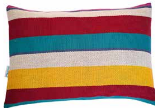
PILLOW SINU LINEAS SMALL REF: ISPS04G SIZE: 13 x 18 inches (33 x 46 cm)