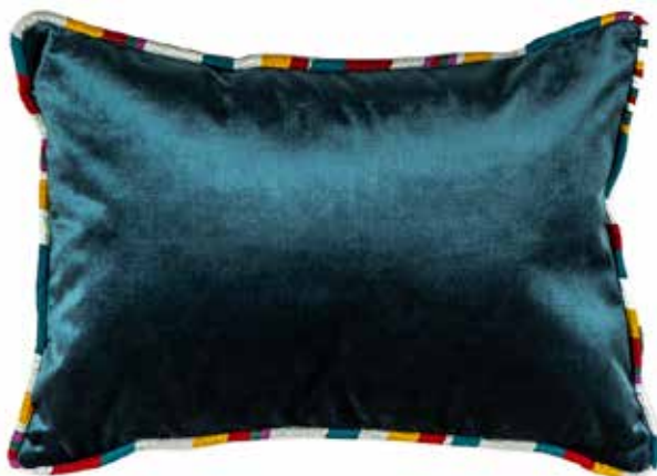
PILLOW SINU TERCIOPELO SMALL