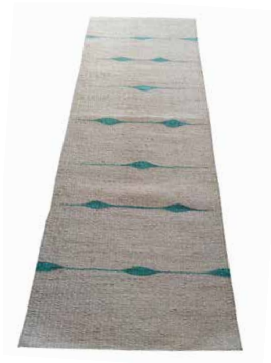
SIRI Sinú REF: SRL1Aqua SIZE: 32 x 87 inches (80 cm x 220 cm)