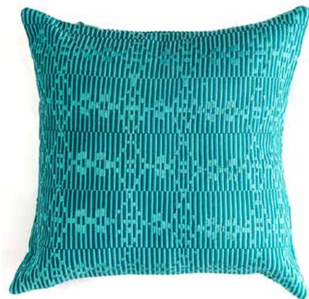
PILLOW SINU AGUA LARGE