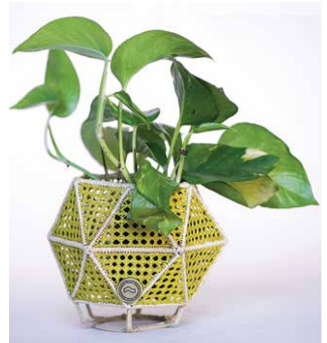
PITAYA REF: ISP15A/C SIZE: 6 x 8 inches (15 x 20 cm)