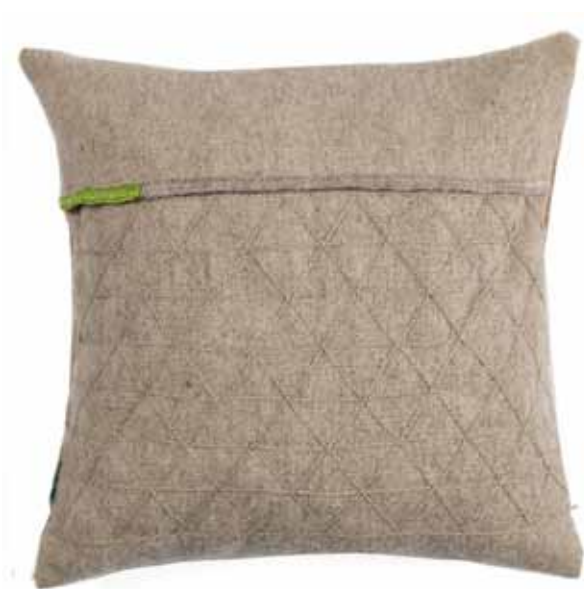
REF: PHC-POO4L - HANNAH IVORY SIZE: 20 x 20 inches ( 50 cm x 50 cm ) FOB $84.00