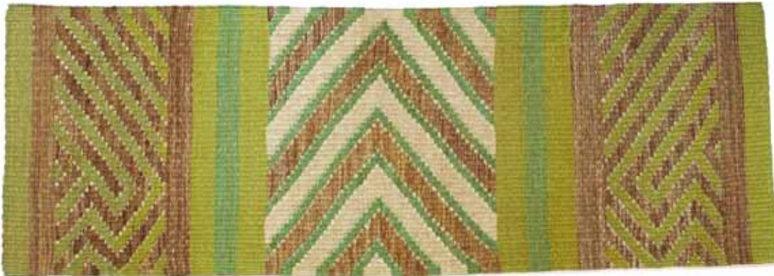
REF: PHC-ROO7L- Siri Lime SIZE: 32 x 87 inches ( 80 cm x 220 cm) FOB $220.00