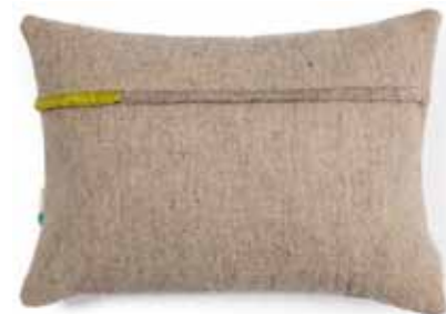
REF: PHC-POO7S - NUDE IVORY SIZE: 13 x 18 inches (33 x 46 cm) FOB $54.00