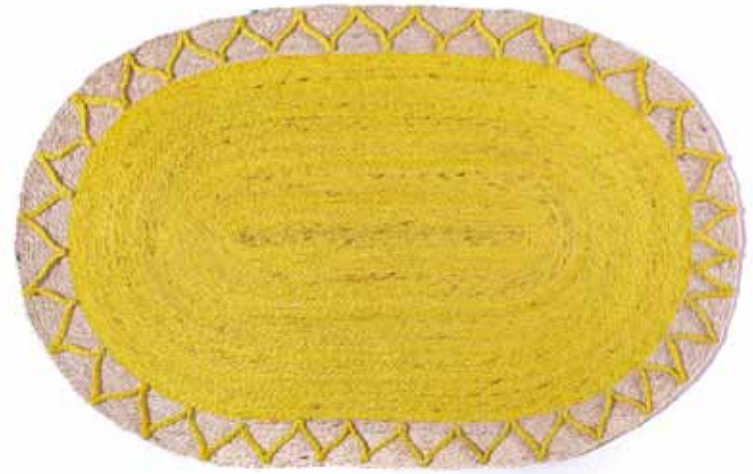
REF: PHC-ROO2- Ovala Figue Yellow SIZE: 45 x 28 inches (110 cm x 70 cm) FOB $ 110.00