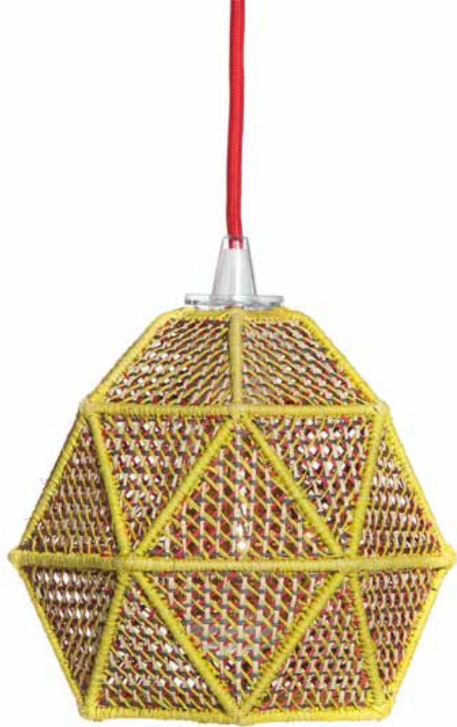
REF: PHC-LOO2- FOLIAGE RED SIZE: 8 x 7 x 8 inches. (20 x 18 x 20 cm ) FOB $85.00