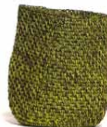
REF: PHC-COO3S FLORA GREEN SIZE: 6 x 8 inches (15 x 20cm) FOB $28.00