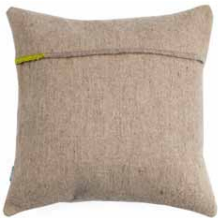
REF:PHC-POO2L - NUDE IVORY SIZE: 20 x 20 inches ( 50 cm x 50 cm ) FOB $74.00