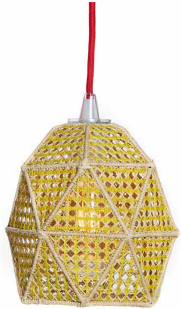
REF: PHC-LOO3- FOLIAGE YELLOW SIZE: 8 x 7 x 8 inches. (20 x 18 x 20 cm) FOB $85.00