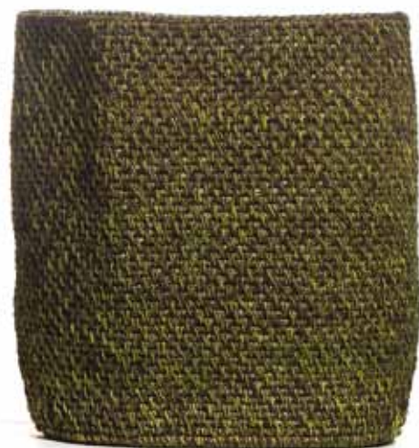
REF: PHC-COO1L FLORA GREEN SIZE: 14 x 16 inches (35 x 40 cm) FOB $70.00