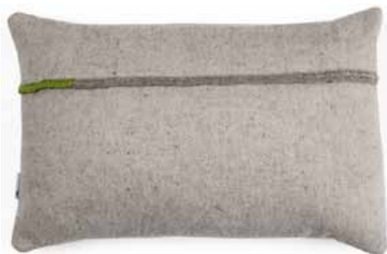
REF: PHC-POO8M - NUDE LIGHT SIZE: 16 x 24 inches (40 x 60 cm ) FOB $64.00