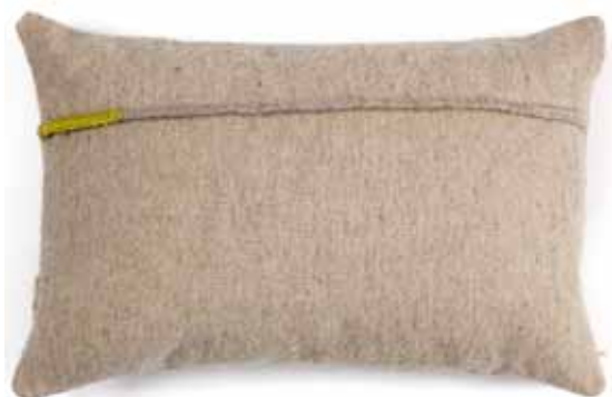
REF: PHC-POO6M -NUDE IVORY SIZE: 16 x 24 inches (40 x 60 cm ) FOB $64.00