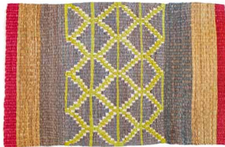
REF: PHC-ROO5M- Siri Paramo SIZE: 39 x 28 inches ( 100 cm x 70 cm) FOB $105.00