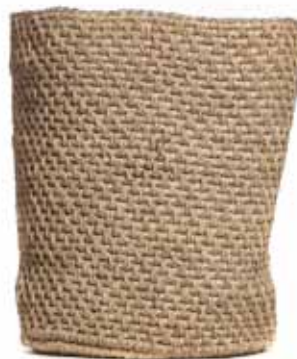
REF: PHC-COO5M FLORA IVORY SIZE: 11 x 8 inches (28 x 20 cm) FOB $35.00