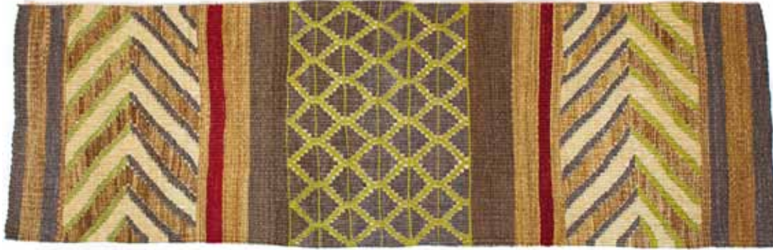
REF: PHC-ROO6 L- Siri Paramo SIZE: 32 x 87 inches ( 80 cm x 220 cm) FOB $220.00