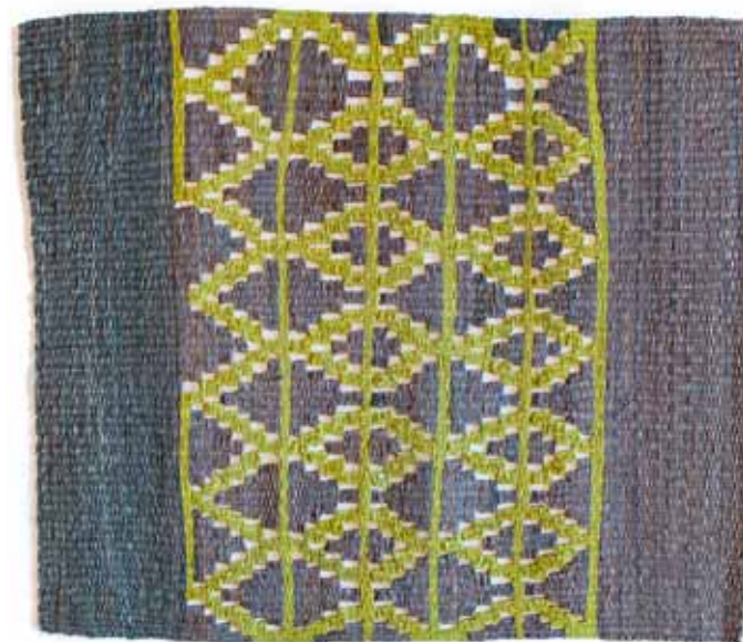
REF: PHC-ROO4S- Siri Paramo SIZE: 25 x 28 inches ( 63 cm x 70 cm) FOB $65.00