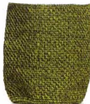
REF: PHC-COO2M FLORA GREEN SIZE: 11 x 8 inches (28 x 20 cm) FOB $35.00