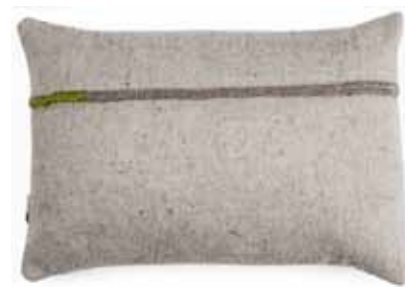
REF: PHC-POO9S - NUDE LIGHT SIZE: 13 x 18 inches (33 x 46 cm) FOB $54.00