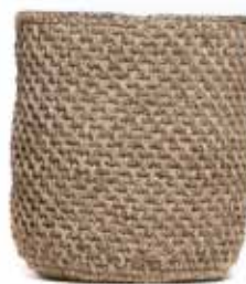
REF: PHC-COO6S FLORA IVORY SIZE: 6 x 8 inches (15 x 20cm) FOB $28.00