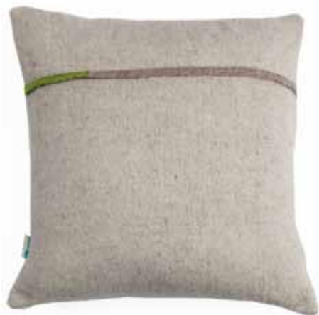
REF: PHC-POO3L -NUDE LIGHT SIZE: 20 x 20 inches ( 50 cm x 50 cm ) FOB $74.00