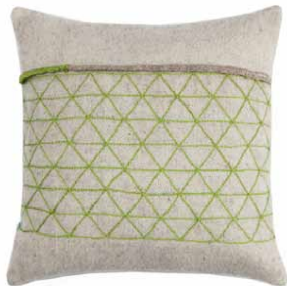
REF: PHC-POO5L - HANNAH EMERALD SIZE: 20 x 20 inches ( 50 cm x 50 cm ) FOB $84.00