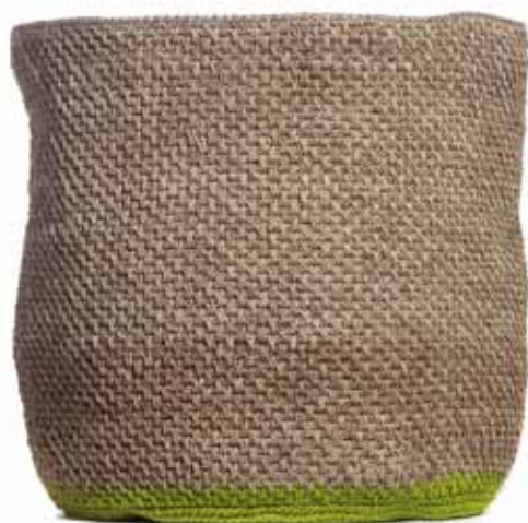
REF: PHC-COO4L FLORA IVORY SIZE: 14 x 16 inches (35 x 40 cm) FOB $70.00