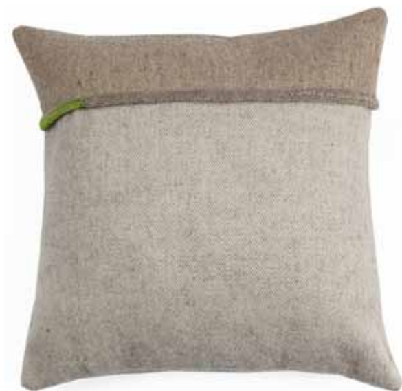
REF: PHC-POO1-L - NUDE MIX SIZE: 20 x 20 inches ( 50 cm x 50 cm ) FOB $74.00