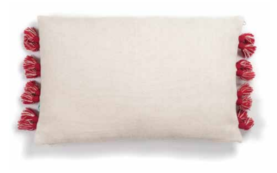
REF: RSPO4 – Beige Pillow with Twin Red Tassels SIZE: 16 \times 24 inches ( 24 cm \times 60 cm )