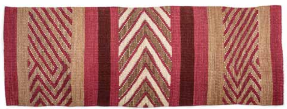
REF: RSRO2-Seri Red SIZE: 32 × 87 inches [ 80 cm × 220 cm]