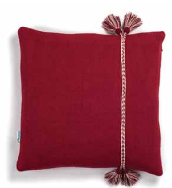
REF: RSPO1 - Red Pillow with Tassels SIZE: 20 x 20 inches (50 cm x 50 cm)