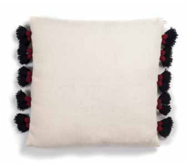
REF: RSPO2 – Beige Pillow with Twin Black Tassels SIZE: 20 \times 20 inches ( 50 \text{ cm} \times 50 \text{ cm} )