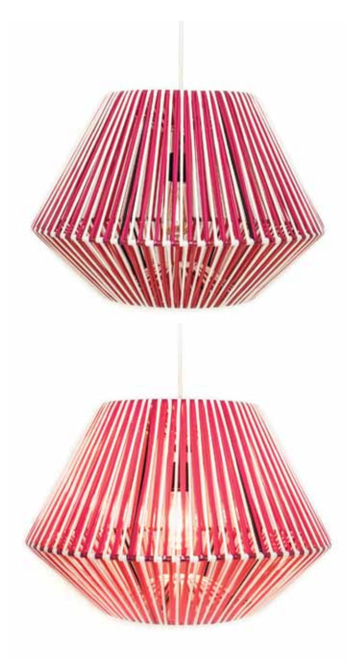
REF: RSLO2-Pitaya Light

SIZE: 16 \times 22 inches (40 \text{ cm} \times 57 \text{ cm})