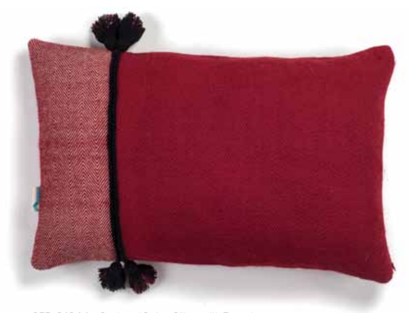
REF: RSPO3 – Red and Beige Pillow with Tassels SIZE: 16 \times 24 inches ( 24 cm \times 60 cm )