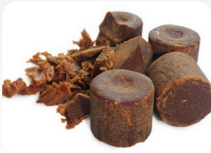
Coconut Palm Jaggery Sugar Chunks