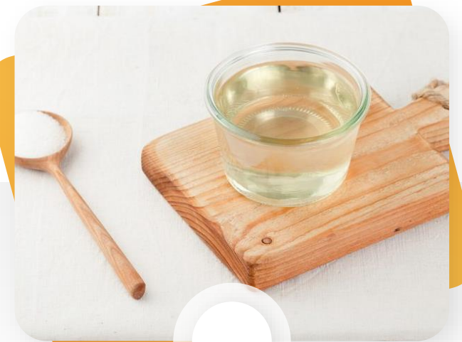
Liquid / Invert Sugar