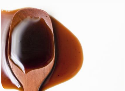
Organic Liquid Coconut Palm Sugar