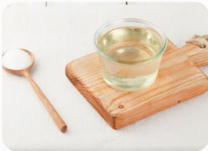
Organic Inverted Liquid Cane Sugar