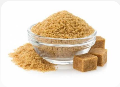
Low-GI Organic Brown Cane Sugar