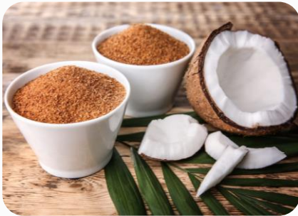
Granulated Coconut Palm Sugar

Our sugar is made from the sap of the coconut tree and Cane. The sap collected by cutting the tree and stored in the containers. Then, the sap is boiled to reduce the water content and create sugar paste. Then, the paste is transferred to the mold and allowed it to dry.