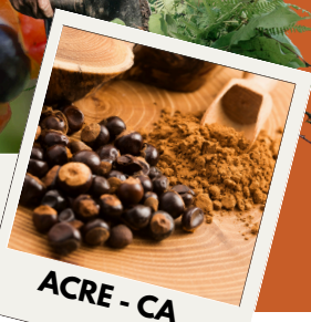
ACRE - CA