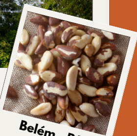
Belém - PA